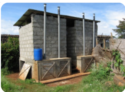
ECOSAN toilet on the Condominium house const-

Human urine and dry faeces should be collected with an EcoSan toilet (A toilet that collects urine and faeces separately and has the capability to dry the faeces). The faeces have to be kept at least during 6 months to be DRY before to be mixed with compost.