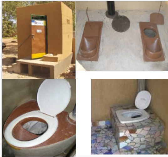
UDDT promoted by the project