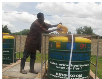
Polytank for storing urine