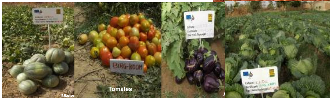
Crops fertilised with Birg-koom