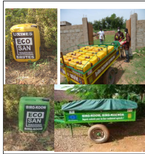
Equipment for collect & deliver urine