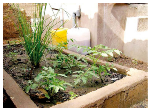
Fig. 6 + Fig. 7: ANAL WASHWATER DRAINED TO A SOAKAWAY (LEFT) AND EVAPOTRANSPIRATION BED (RIGHT) IN MALI

(IFRC) and other organizations. One such initiative was the model village in the northern district of Jaffna where 16 families shared 5 toilets and use ash, soil and sand as additives to faecal collection chamber. Urine is diverted together with the anal wash water to a dispersion plant bed where plants like banana, papaya, tomatoes and coconut are planted. In some project locations the users have by themselves planted plants with larger foliage or with q high leaf area that are more suitable to the plant bed, to enhance evapotranspiration (e.g. leafy vegetables, banana, and cannas or Cannaceae ).