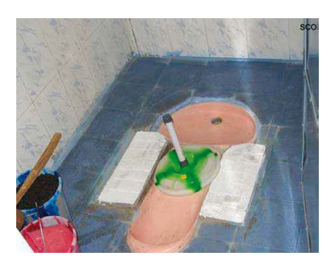
Fig. 3: THREE-IN-ONE SQUATTING PAN DEVELOPED BY SCOPE IN TAMIL NADU

In order to help improved sanitation in the rural and village sector, dry toilets have been introduced during the last two decades in Southern India. Several popular toilet designs using urine diversion have been introduced. The first one promoted by Paul Calvert of Trivandrum, Kerala was a double-vault toilet with two drop holes for faeces built into the cement slab (see Fig. 2). The anal washwater and urine were collected in a central pot and then piped to a small evotranspiration bed containing plants. Special care has to be taken to ed-