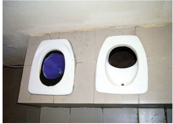
Fig. 5: DESIGN FOR A SEATER URINE DIVERTING DRY VAULT TOILET. ONE SEAT FOR URINE AND FAECES (RIGHT SIDE) AND ONE FOR ANAL WASHING (BURKINA FASO)

Concrete slabs designed by SCOPE are now produced by over 100 trained masons in different locations in Tamil Nadu. A red oxide finish is applied to give a