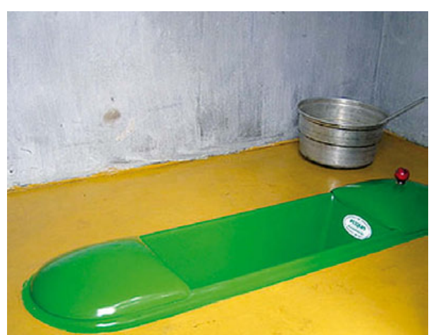
Fig. 2: ECOPAN WITH ANAL WASHING AND URINE COLLECTION (PAUL CALVERT)

As reported by Shojaei et al. (2006), poor personal hygiene by food handlers frequently contributes to outbreaks of food-borne illnesses caused by Staphylococcus aureus and gram negative bacilli such as Salmonella