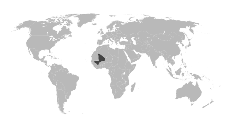
Fig. 1: Project location

Peri-urban urine diversion dehydration toilets (abandoned) Koulikoro, Mali - Draft