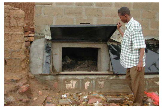
Fig. 5: Faeces vault of UDDT with opening to remove the dried faeces (source: GTZ, 2002).

Peri-urban urine diversion dehydration toilets (abandoned) Koulikoro, Mali - Draft