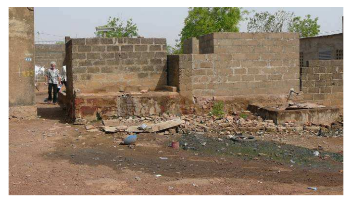
Fig. 8: Former desiccation (drying) chambers of UDDTs have been converted into pits to collect faeces and to be pumped empty when full (source: Stefan Hofstetter, March 2009).