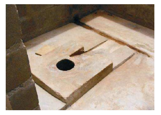
Fig. 6: Latrine urine-diversion squatting pan, where urine drains away to the drainage at the right (source: GTZ, 2002).

To prevent odour and loss of nitrogen any dilution of urine with water must be avoided. The profile of the latrine floor and drainage pipes leads the urine to a closed plastic collection canister. Pure urine is nearly sterile and can be used as a fertilizer (storage is recommended to reduce pathogens from cross-contamination with faeces)<sup>2</sup>.