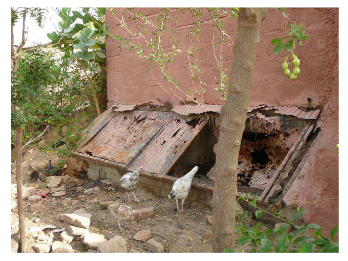
Fig. 9: Rusted iron covers of faeces chambers are falling apart, - no more drying of faeces is therefore possible.

Peri-urban urine diversion dehydration toilets (abandoned) Koulikoro, Mali - Draft