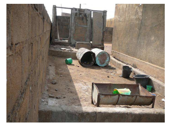
Fig. 7: A former greywater garden, which was once planted with lots of banana plants (source: Stefan Hofstetter, March 2009).

• In family courts many persons (often more than 20) use the toilet, and the temptation to use both toilets conjointly is very high. A lot of comprehension and discipline would be necessary to prevent this. The design of the two toilets should be altered in such a way, that only one toilet (with two holes, one covered, and one operational) exists.