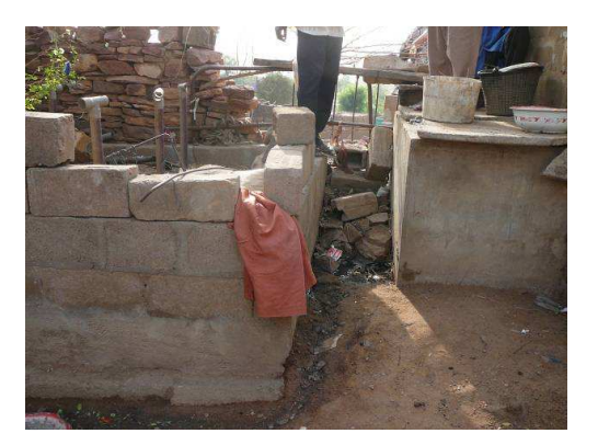
Fig. 4: The same location as Fig. 3: greywater garden on the left side with leaking water from broken pipe

More ecosan UDD toilets were not found, and our guide, Mr. Souleymane Keita (Agent Voirie Mairie Koulikoro), did not know any more locations (perhaps the large toilet building was counted as seven units, so that the total reported number of UDDTs is 11?).