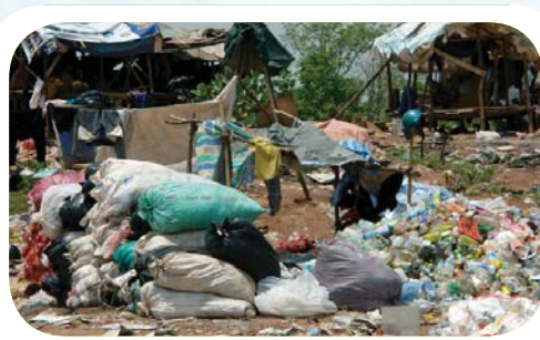
Landfill Km. 30 in Saysetha District, Vientiane Capital