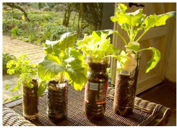
Almost any type of container can be used for growing vegetables: plastic bottles and bags, large food cans, flower pots, wooden boxes, pails, buckets, baskets, drums, and nursery flats. Drainage is important. In the center photo, drainage holes are made in the bottom of a plastic bottle; the top is cut off and placed inside the bottle over the holes. This helps to provide air to the roots.