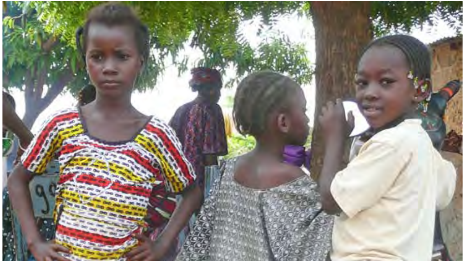
(l): Leaflet promotes the need for vitamin A; (r): Children taking their doses of vitamin A.

Twice a year the Nutrition Division of the Ministry of Health in Mali organizes a Nutrition Week in partnership with the United Nations Children's Fund (UNICEF), Helen Keller International, and the United States Agency for International Development (USAID) Health Program. Nutrition Week combines interventions to directly improve the health of Malians and information to raise awareness and knowledge of nutritional issues.