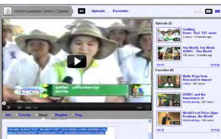
See the video on the World Vegetable Center's YouTube channel: