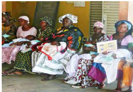
(Top): Group session on nutrition.