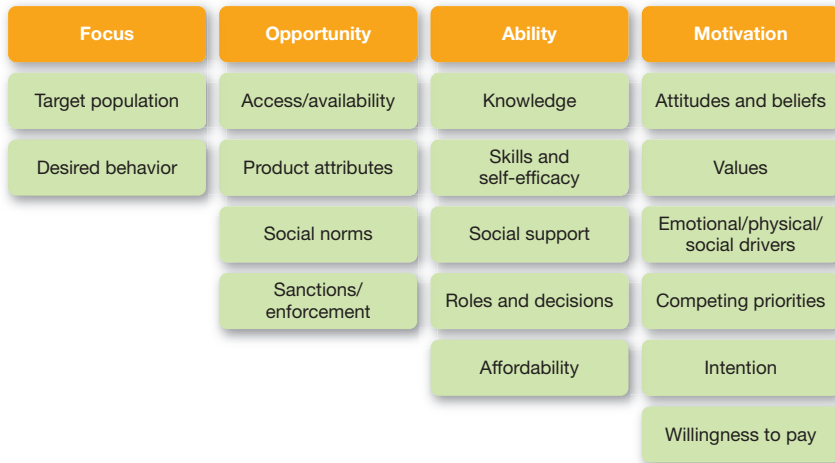
FIGURE 1: SANIFOAM FRAMEWORK