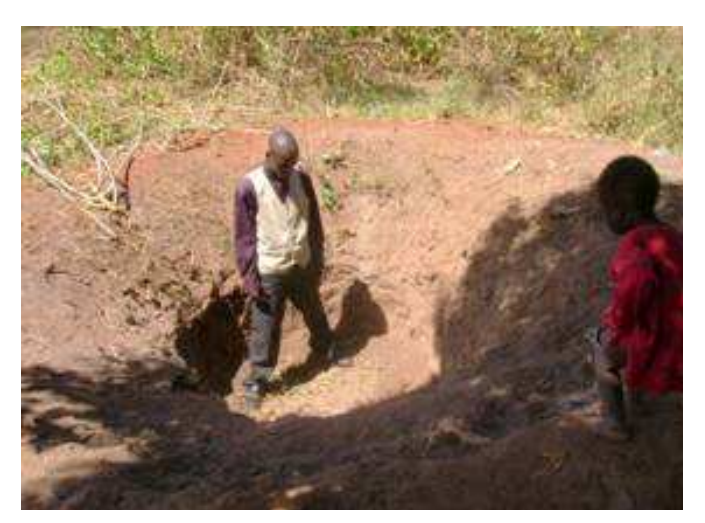
Fig. 6: Preparation of a composting pit.

Composting at household level according to the described methods involves zero to minimal costs. The inputs are usually for free and no extra investments have to be made. Some users prefer composting in a pit rather than on the ground to prevent the pile from being disturbed by the wind or roaming animals (goats, pigs and cows) (Fig. 6). The costs of digging such a pit can add up to EUR 25.