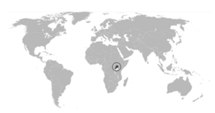
Fig. 1: Project location

Household composting of organic waste and faeces Kitgum Town, Uganda