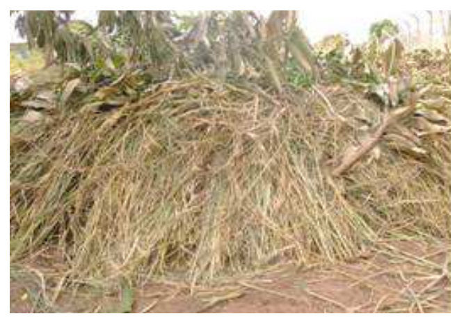
Fig. 4: Windrow covered with grass and mango leaves in Mrs. Aleng Christian's Home (photo by Samuel Olweny, 2009).

the size of the land available and the amount of materials to be piled at once (Fig. 4).