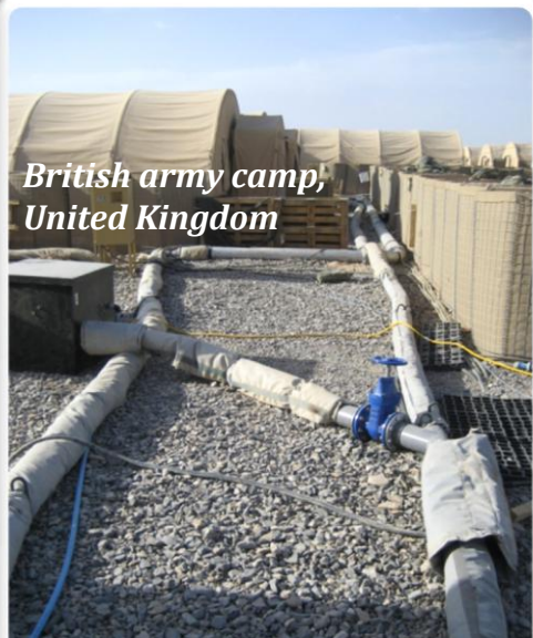
British army camp, United Kingdom