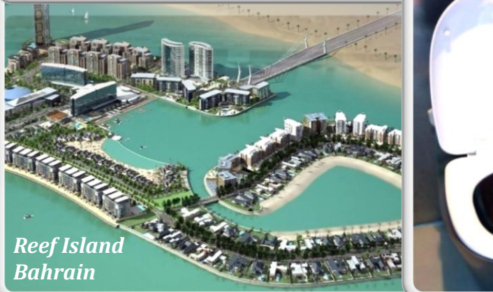
Reef Island Bahrain