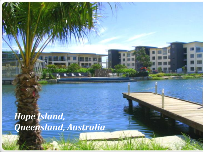
Hope Island, Queensland, Australia