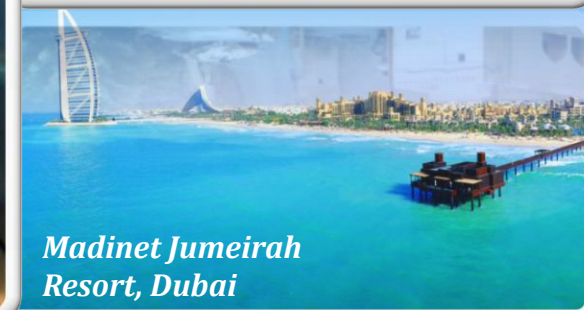
Madinet Jumeirah Resort, Dubai