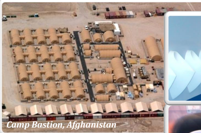
Camp Bastion, Afghanistan