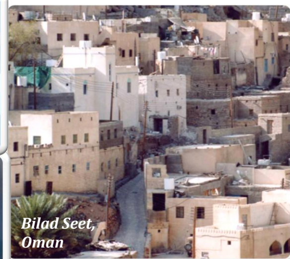
Bilad Seet, Oman