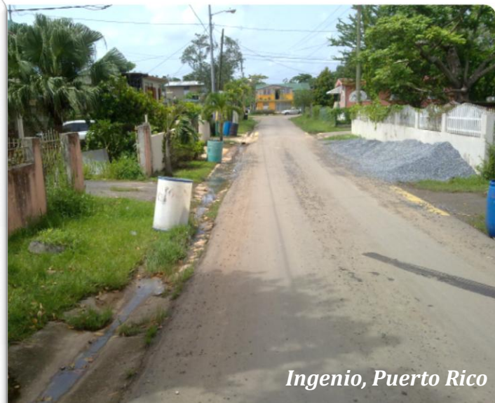
Ingenio, Puerto Rico