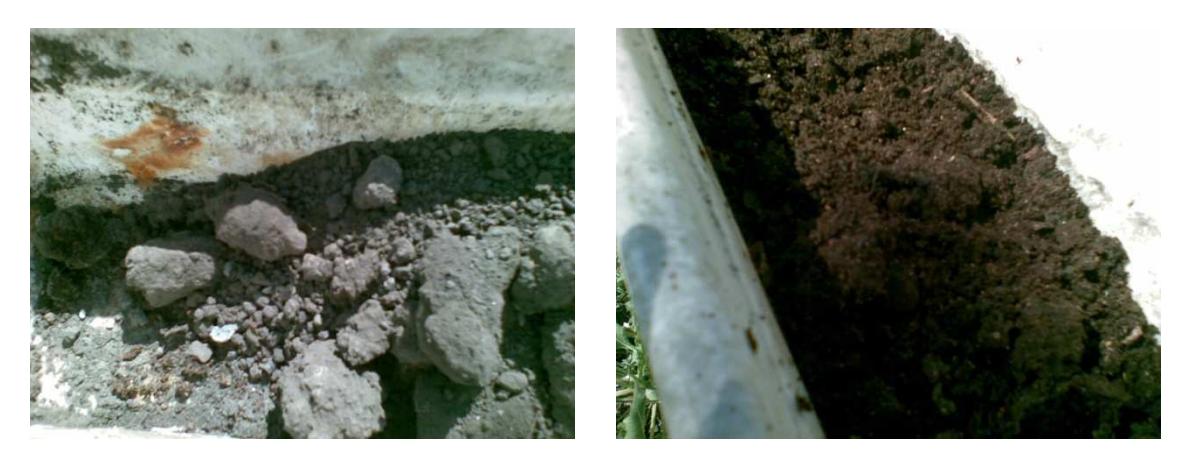
Figure 1 Stored faeces from Băcșeni (covering material: soil) and Boldurești (covering material: fine sawdust and soil (3:1)

degrade very slowly. Comparing two types of faeces stored for a period of approximately one year (Figure 1) from Bolduresti and Băcseni, we have found big differences in the end product. In the first case where only soil was used as covering material and stored under dry conditions, the obtained product was very hard and still smelly. On the contrary, the faeces kept in plastic bags covered with fine sawdust and soil, had no bad smell, but was homogenous, good texture compost, similar to the one from the market. The difference could be explained by the fact that the faeces from first site were only desiccating, with little decomposition. Due to lack of plastic containers, the faeces from second place were kept in closed plastic bags and most probable, the anaerobic conditions created in the plastic bags, favoured partial lacto fermentation. The From this observation it can be presumed that plastic bags can be used as a low cost solution for temporary storage and pre-treatment for human faeces under the toilet chamber of household UDDT, instead of plastic containers. This would avoid the problems that appear with flies in open containers from the toilet chamber. Also, the quality of end product to be applied to the soil can be improved. To ensure an initiation of lacto-fermentation process microbial innoculum, as well as biochar can be added in the plastic bags, when they are closed for storage or in the covering material. Additional research is needed for proving these facts.