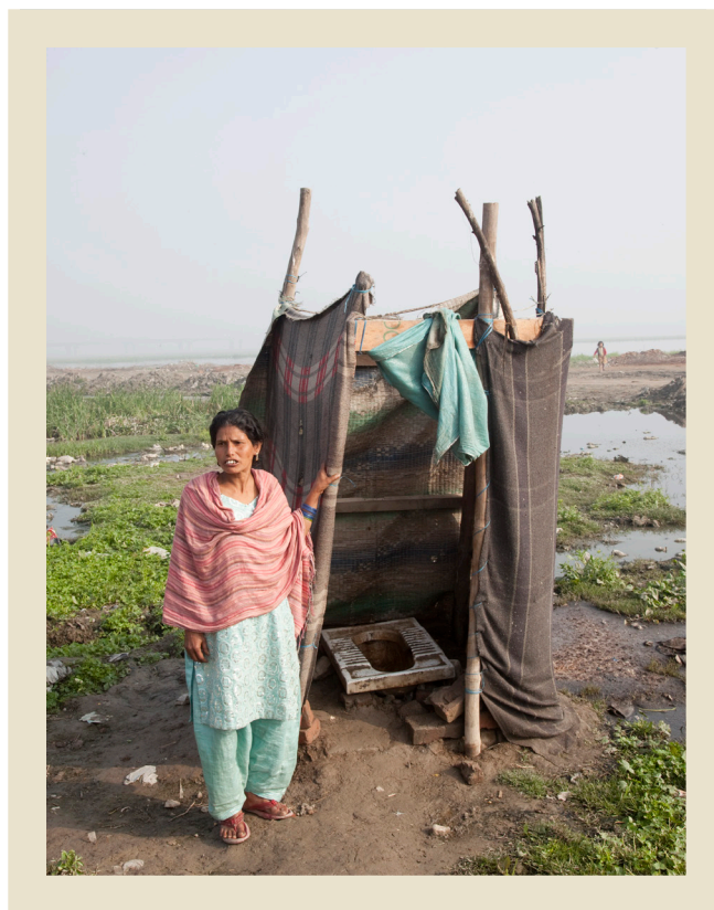
A woman standing outside a makeshift toilet built in a public area on the bank of the Yamuna river (Batla House locality, New Delhi, India, 2011).

The Community-Led Total Sanitation approach originated in Bangladesh 10 years ago, and it has contributed to strong national progress on sanitation. Our grant to WSP has worked to build on this learning; to add elements that improve the supply side, the policy environment, and local capacity building; and to test these approaches at significant scale in multiple locations. We continue to learn from this grant about how to deliver sustainable sanitation at scale. We are working with WSP and other partners that use variations of the community-led approach to improve the uptake, sustainability, and cost-effectiveness of these models.