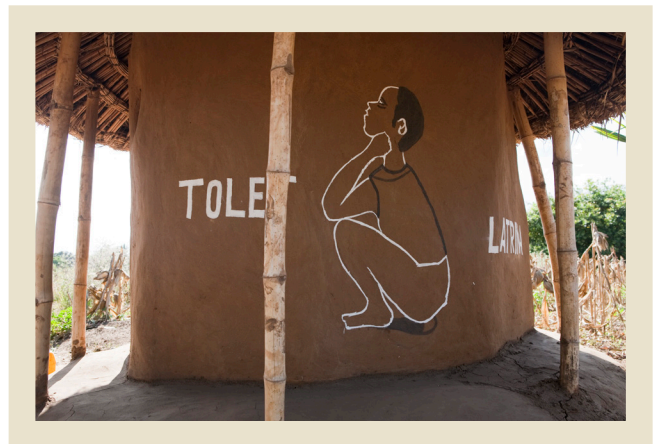
A latrine in Macua village where each household has a functional latrine, earning the village ODF status (Buzi, Mozambique, 2009).

We also advocate to support and prioritize innovative and sustainable sanitation solutions. The goal is to encourage