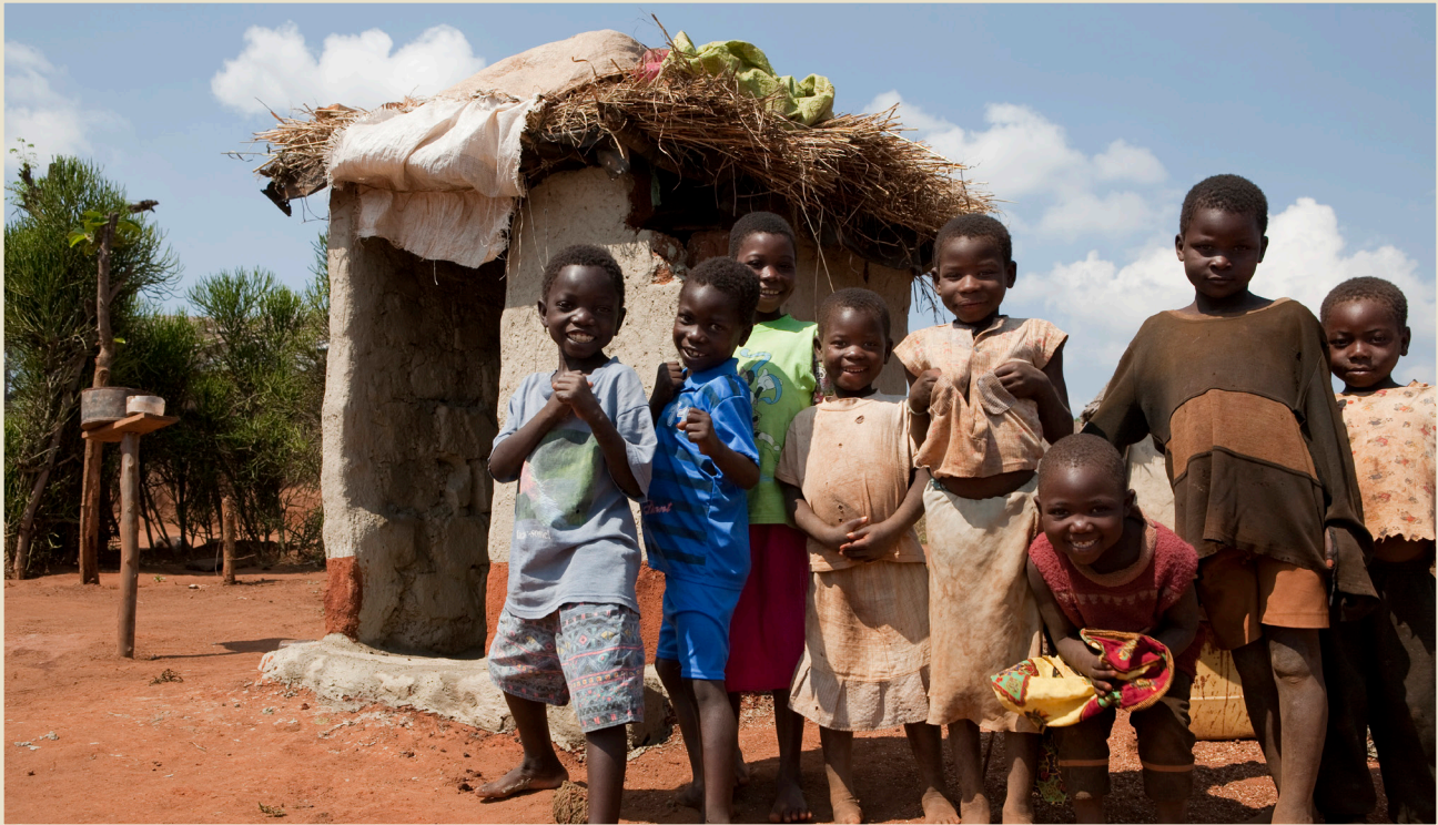
Children posing in front of a latrine in Venceremos village. This village in the Gondola district is “open defecation free,” which means every household uses a functional latrine (Mozambique, 2009).