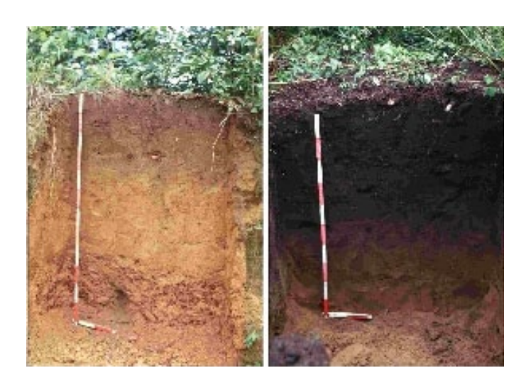
Alhaji S. Jeng's presentation (2010): Biochar: Production and Importance in Agriculture. Norway

As soil improvement product and water retainer making soils more resilient to climate change, biochar would increase the quality of Susan-Design product. Bio mass from food preparation and sanitation, which have no constructive role in an urban slum, will be brought out of the - Kampala - slum for treatment and safe reuse. The large volumes of urine will be used as fertilizer and the bio mass from food etc. will be transformed into charcoal briguettes, or integrated as biochar into solids to improve the pathogen kill off during the treatment process before integration as soil improvement product for farmers to assure their productivity and the lands ability to hold water. This is CO2 sequestration in its pure and cheap form. A bio waste that rots in the open releases CO2 while the bio waste transformed into biochar will be integrated into the soil improvement product for improved farming. Hence biochar approach is suited for urban renewal and agricultural development as value creation from urban bio materials. Biochar production will be an added value to the Susan-Design endeavor of linking sanitation to agriculture for the sake of food security and sanitation for all with its economic and health benefits; ultimately raising the living standard of communities.