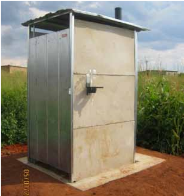
Figure 15: Since 2011 precast superstructures are the norm for the ANDM's sanitation programme. The change was motivated by long term maintenance considerations – it was felt that it would be preferable to build a new substructure and move the superstructure than to empty the pit.