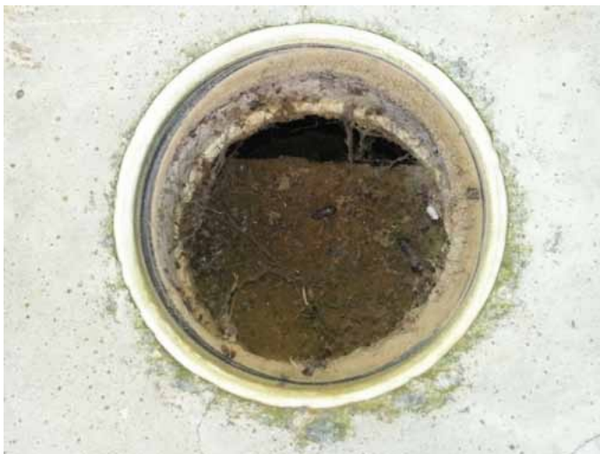
Figure 23: The opening for the vent pipe should be unobstructed. In this case most of the opening sits on top of the wall of the pit lining, thus making it much less effective.