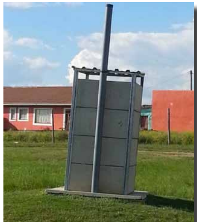
Figure 22: Many of the precast VIPs seen near Mt Ayliff are not vertical. Better specifications and quality standards are needed.