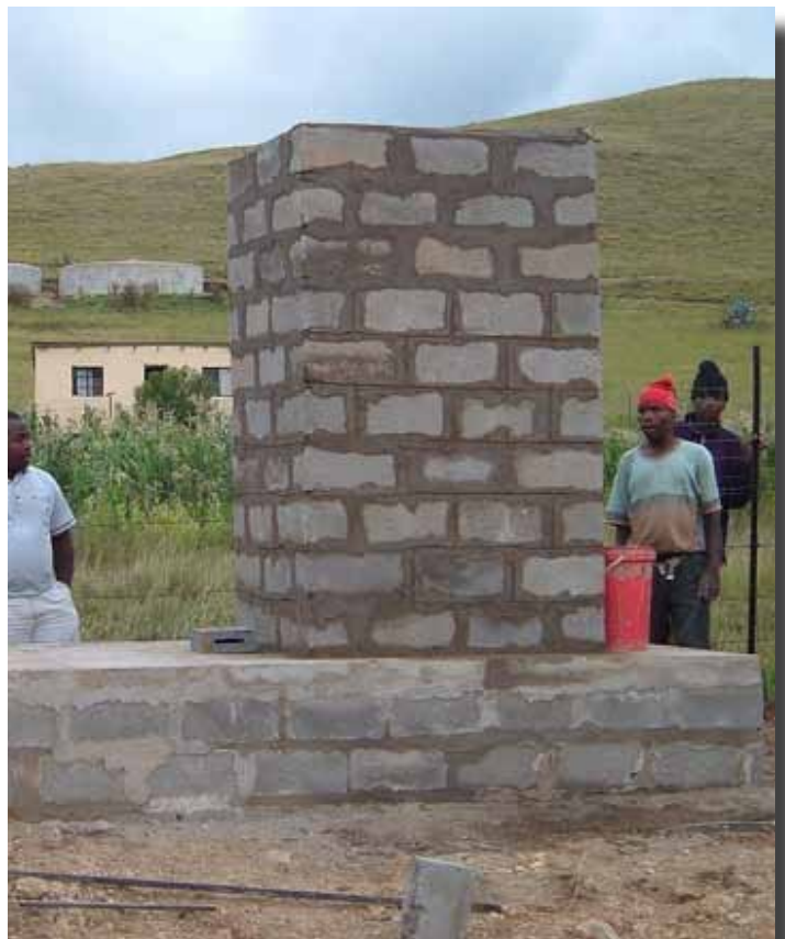
Figure 18: A raised and extended pit is used where there is inadequate soil depth. The usable pit volume should be at least 2 m 3 to give a pit a design life of 7 years or more, but larger is better.