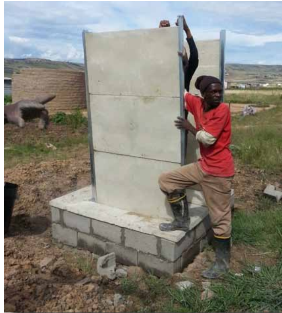
Figure 16: Blocks are still used for the substructures and pits are fully lined for structural stability. Below ground level the vertical joints of the blockwork are left open to enable leaching – this is very important. Failure to do so results in sealed or semi-sealed pits which can be expected to need emptying at least once every year, if not more often.