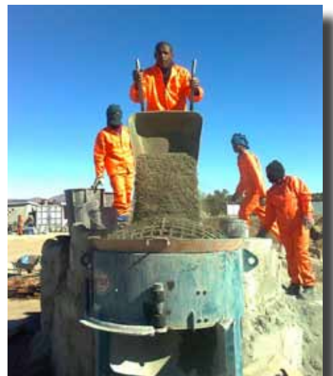
Figure 8: At the Maggie Resha Zone Site in Maluti a pan mixer is used to prepare the aggregate and cement for the casting of blocks