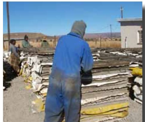
Figure 7: The use of an innovative stacking system makes it possible to cast large numbers of slabs in a relatively small area