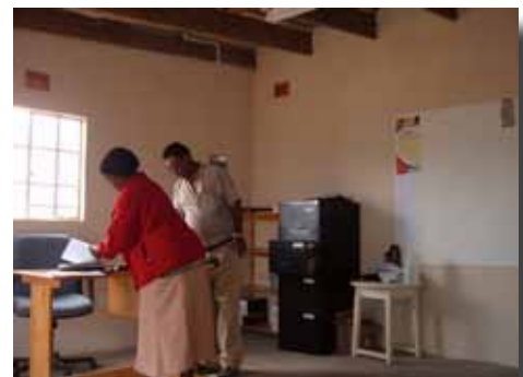
Figure 5: The office of the Maggie Resha MZSC at Maluti - one of nine Municipal Zone Services Centres which were built during Phase 1 of the ANDM Sanitation Programme