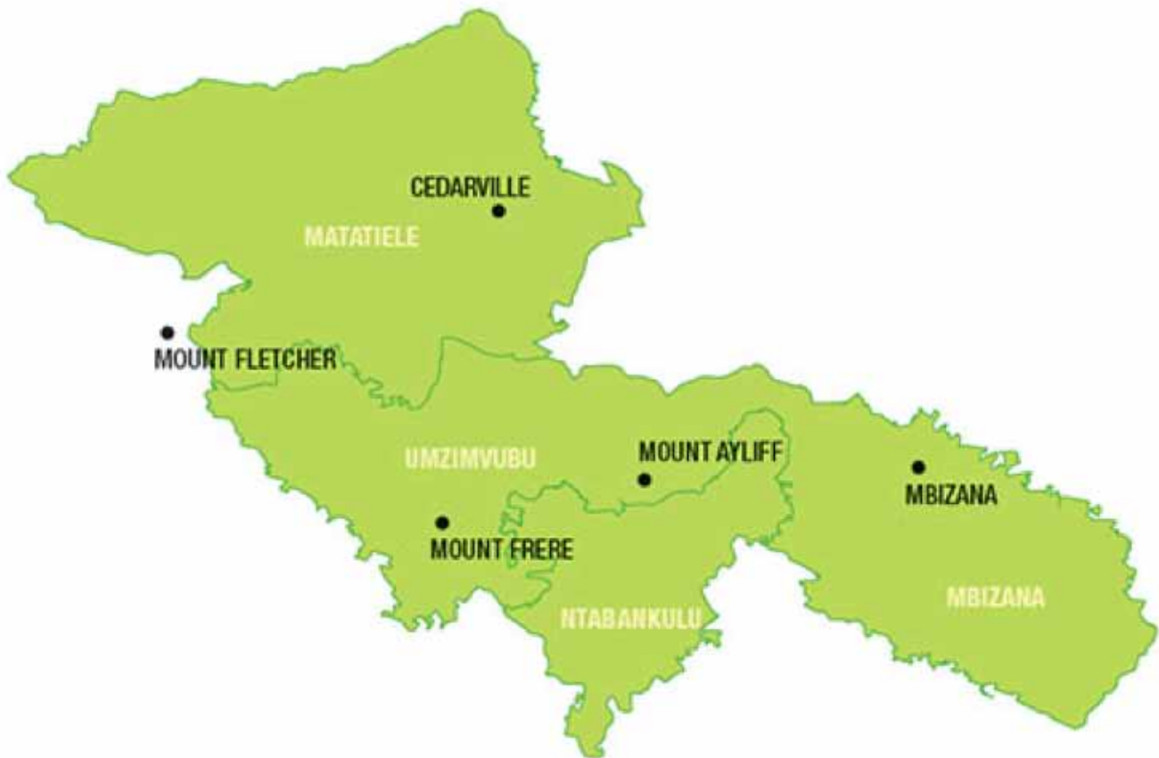
Figure 2: The ANDM is now made up of four local municipalities: Matatiele; Umzimvubu; Ntabankulu; and Mbizana