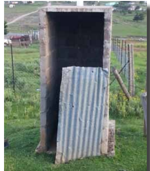
Figure 19: A problem with the ANDM sanitation programme and many similar programmes elsewhere in South Africa is a lack of quality guidelines and/or quality control. The latrines in the background were built by one of the service providers in the first phase of the programme. The doors proved to be not durable and now need to be replaced.