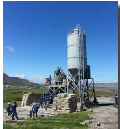
Figure 10: At the Mt Ayliff Zone Site cement is purchased in bulk and stored in the silo. On the left is a pan mixer. This installation has a capacity to produce up to 5 000 blocks per day, which is more than the sanitation programme requires. The spare capacity could be used to supply blocks to the local housing market.