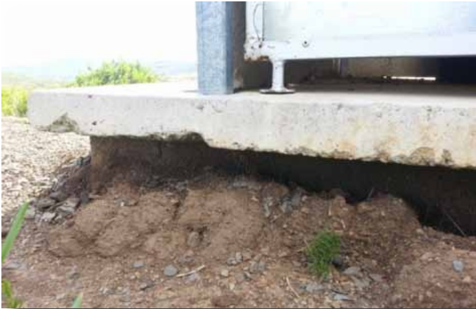
Figure 20: The precast slab in this design (seen in a village near Mt Ayliff) does not fit evenly on the substructure