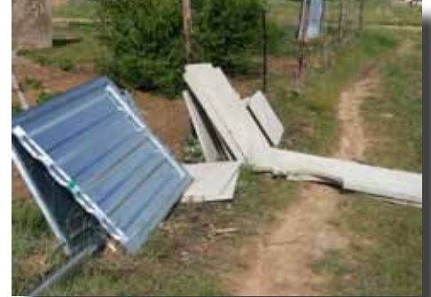
Figure 13: On-site delivery of everything that is required for the superstructure, ready for assembly: two floor slabs, a galvanised steel frame, nine wall panels, the galvanised steel door and the galvanised steel roof (complete with frame).