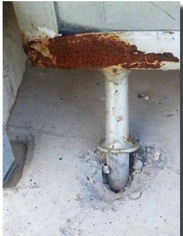
Figure 21: All steel components must be hot dip galvanised or they will not last. Also, attention needs to be given to the alignment and strength of the door swivel pins and the swivel sockets.