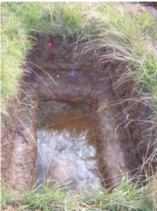
Figure 17: The internal usable volume of a pit should be at least 2 m 3 if a pit is to last a family of six more than seven years before emptying or moving is required. Where the water table is high or where the soil depth is shallow the pit must be raised and extended (Figure 18).