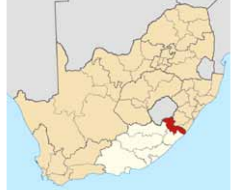
Figure 1: The Alfred Nzo District Municipality shown highlighted on the map of South Africa

The Alfred Nzo District Municipality in the Eastern Cape is bounded by the Drakensberg escarpment and the Lesotho border in the west, the Indian Ocean in the east, the KZN District Municipalities of Sisonke and Ugu in the north and the Eastern Cape District Municipalities of Joe Gqabi (formerly Ukhahlamba) and OR Tambo in the south (Figure 1). When it was first demarcated in 2000 it comprised three local municipalities, namely Matatiele, Umzimvubu and Umzimkhulu. After the 2006 local government elections the latter was re-demarcated into Sisonke, and after the 2011 elections the local municipalities of Bizana and Ntabankulu (previously under the OR Tambo district) were incorporated into the ANDM. The population of the district has over the past decade therefore first decreased and now increased. Its present level is estimated at 801 344 people and 169 261 households.