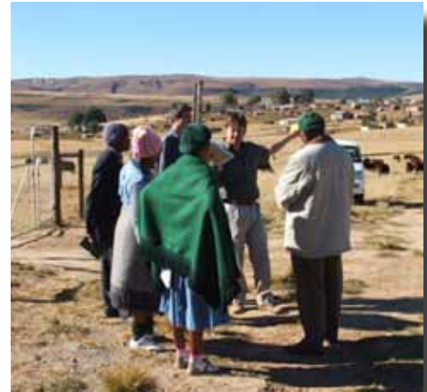
Figure 3: The ANDM sanitation programme has always had a strong community focus, with local involvement in both planning and implementation.

A possibly unavoidable outcome of the community focus and the political need to spread resources evenly has been the stop-start nature of the work in each village. Instead of completing sanitation in each village before moving on, the programme has generally been allowed to build only limited numbers of VIPs in each village before having to move to another village, which is inefficient and drives up costs.