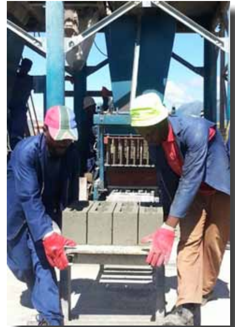
Figure 11: At the Mt Ayliff site blocks are cast by the static block press on to wooden pallets which are then moved and placed on the ground in the surrounding area. This system obviates the need for the large flat concrete slab which is needed for a moving block press (Figure 9).

Apart from the trucks which are needed to haul the materials from the zone site to the villages, a certain amount of transport is required within the villages. Local tractor owners are contracted to move these materials for an agreed rate per load. A challenge is to ensure that the vehicles are roadworthy and do not endanger the lives of the workers who travel around with them.