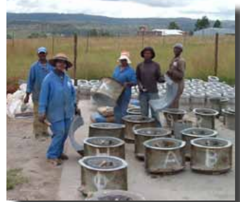
Figure 6: During the first two phases pedestals were made at the zone sites. Lately the programme has switched to plastic pedestals, which have the advantage of being easier to transport, and which are also easier to keep clean when in use

With up to 100 toilets being built in each zone per week, the space required to cast the slabs presented a problem. A newly cast slab cannot be moved for up to a week while the fresh concrete cures and increases in strength. An innovative system was developed using removable spacers and plastic sheets which allowed the slabs to be cast one on top of each other, greatly reducing the space required for a large pre-casting operation.