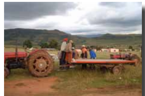
Figure 12: Transport is a major component of a rural sanitation programme. The ANDM have made extensive use of community based transport contractors.