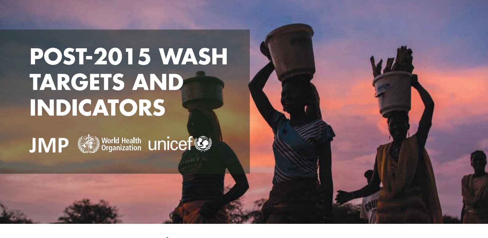
Women, some of whom balance containers on their heads, cross a road that has been inundated with waters caused by seasonal flooding.

Proud Owners of Newly Built Bathroom financed through a loan from a local microfinance institution in Peru.