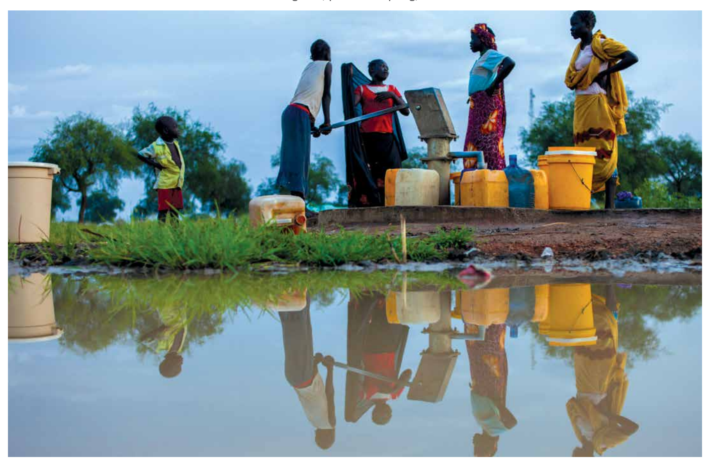
Their images reflected in a pool of water, women collect water at a handpump, in the town of Jammam, in Maban County, Upper Nile State.

Pre-2015 JMP definition of an improved drinking water source: An improved drinking water source is defined as a source or delivery point that by nature of its construction or through active intervention is protected from outside contamination, in particular from contamination with faecal matter. They include: piped drinking water supply on premises; public taps/standposts; tubewell/borehole; protected dug well; protected spring; rainwater.