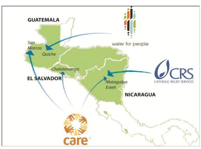
Figure 1: Map of intervention for SWASH+ 2nd phase (adapted from Water Corps Monitoring Report 2011)

The MWA was contracted by IDB to implement the programme in accordance to the ToR drafted by the IDB. They prepared the Implementation Manual, which they shared with the various NGO partners in each country. Through the signature of MOUs, government agencies, such as the Ministry of Education (MoE), the Ministry of Health (MoH) and national water authorities committed to support the implementing partners during project implementation and to ensure follow-up of the beneficiary schools. In Nicaragua, CARE and CRS targeted 17 and 26 schools