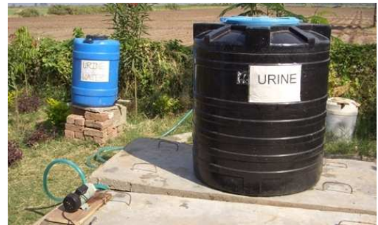
Fig. 9: Urine is lifted through a solar-operated non-corrosive pump tank (bottom left corner) to storage/hygienisation tanks (black tank “urine”). Urine is diluted with water (blue tank “urine + water”) before application (source: seecon gmbh, December 2008)