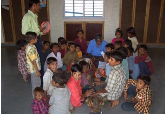
Fig. 4: Students of Rayka school during music lessons

running 10 months out of the year and the state curriculum is applied in order to be recognized by the state government. The main units of each school are the classrooms (Fig. 4). Conceptualized as boarding schools, these classrooms are used as dormitories in the evening.