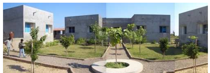
Fig. 3: View of Navsarjan Primary School at Rayka village.

The three villages are situated in remote, water scarce areas without any connection to public water supply. Drinking water has to be hauled by trucks from the nearest villages. Today, each school uses ecological sanitation systems for its toilet needs.