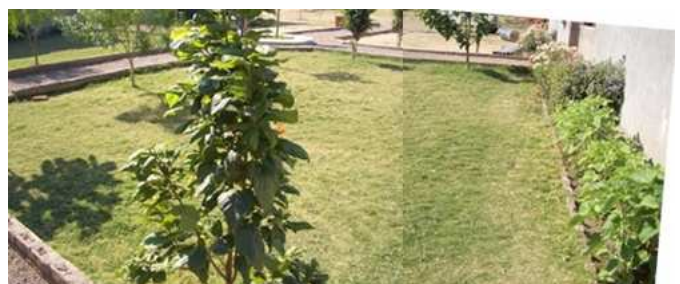
Fig. 11: Lawn at Rayka school where greywater is applied

Pre-treated greywater from bathrooms (showers and washbasins) is reused for gardening purposes (Fig. 11).