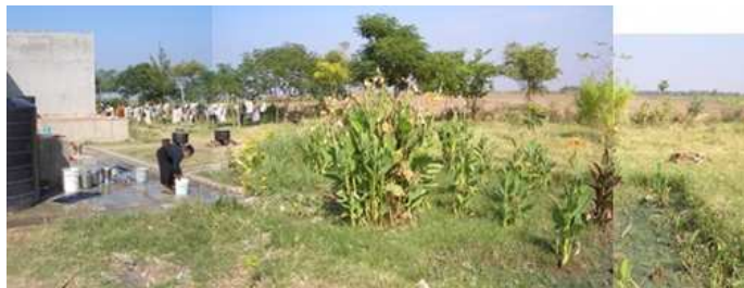
Fig. 12: Garden for local infiltration of greywater spilled at water tank.

Water can be spilt by people when filling water into buckets at the storage tank. This water is hauled to the garden plants through a ditch (Fig. 12).