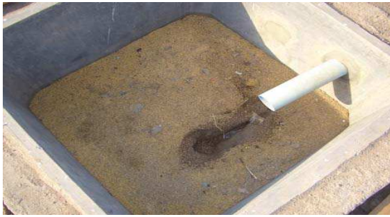
Fig. 7: Vertical flow filter for greywater treatment (at Rayka school) (source: seecon gmbh, April 2006).