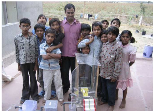
Fig. 13: Through proper training, the students have become ecosan experts, having constructed a model of their toilet and even won the first prize in the Ahmedabad School Science Fair

Other important project components were hygiene education and awareness raising campaigns aimed at promoting hygienically safe sanitation concepts as part of the curriculum (Fig. 13).