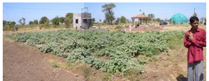
Fig. 10: Kitchen garden at Rayka school where “compost” and urine are applied (source: seecon gmbh, March 2009).

The “compost” (i.e. desiccated faeces and cover material) and urine are applied as soil conditioner and nitrogen-rich liquid fertilizer to flower beds, kitchen gardens, etc. (Fig. 10).