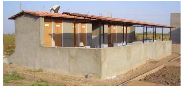
Fig. 5: Sanitation facility at primary school in Rayka village.

The urine-diversion dehydration toilet centre at the primary school in Rayka village was introduced on February 25 th , 2006. Sanitary facilities at the boarding school in Katariya village were put in operation in end of July 2006 and those in Sami taluka followed soon afterwards.