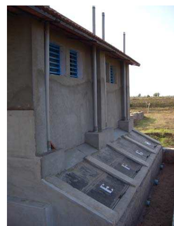
Fig. 6: Rear view of UDDT at Rayka village.

In order to facilitate the harvest of the finished "compost" (desiccated faeces and cover material), the toilets are designed to operate in batches and cubicles which act as showers during the "resting period". If a processing chamber is full, the cubicle above is converted into a "bathroom". By providing a specially designed cover, the urine-diversion squatting pan is closed and it prevents shower water from entering in either the processing chamber or the urine collection system. Greywater collected from bathrooms, washbasins and the laundry area is drained to a vertical flow filter filled with organics (rice husk, saw dust, etc.) to retain the solids on top of the organic layer (Fig. 7). Water for anal cleansing is used but has to be carried in buckets from water taps outside the toilets.