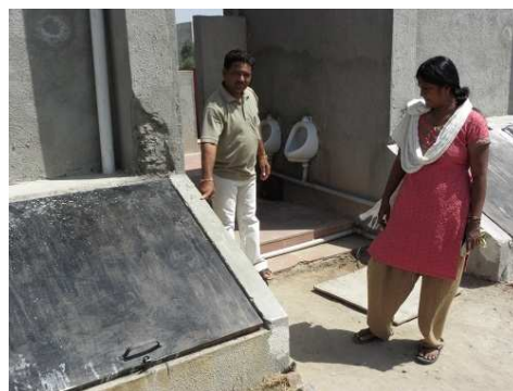
Fig. 14: Teacher indicating highest flood level after a heavy downpour at Sami village at the beginning of monsoon season 2009 (source: seecon gmbh, October 2009)