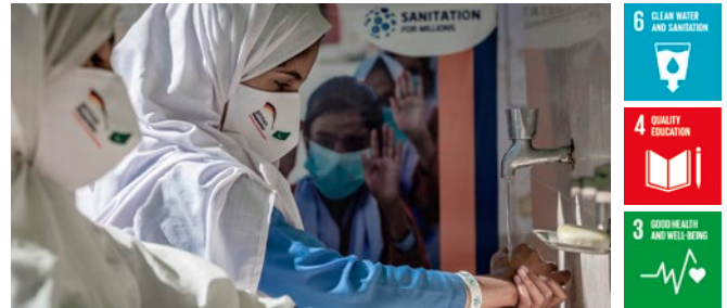
Students washing hands with soap and wearing facemasks at school

The situation is worst in Balochistan and Khyber Pakhtunkhwa, where around 43 % of schools do not have access to safe