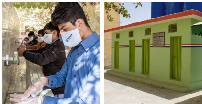
Left to right: Students practising group handwashing with social distancing; The main structure of new toilets and handwashing facility is ready

Sanitation for Millions initiated its interventions in refugee hosting communities in Balochistan in July 2017. The GIZ is leading the programme implementation and cooperates closely with local partners such as the Balochistan Rural Support Programme (BRSP) , Sabawon and with international NGOs such as the Bremen Overseas and Research and Development Association (BORDA e.V.) and German Toilet Organization (GTO) . The programme cooperates at the national level with the Ministry of States and Frontier Regions (SAFRON) , Ministry of Climate Change (MoCC) and at the provincial level with the Department of Education and the Department of Health of the provincial governments of Balochistan and Khyber Pakhtunkhwa.