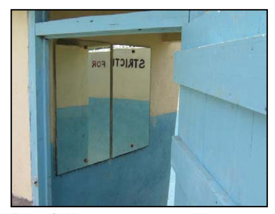
FIGURE 2. MIRRORS WERE PLACED IN ATONO PRIMARY.

The design of the urinal itself was described as "good" by students as the foot pads prevent urine from splashing on their feet.