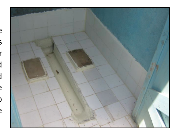
FIGURE 1. TILE FLOORING WAS USED FOR THE URINAL IN ATONO PRIMARY

Findings in this report have been divided into three main categories including: infrastructure, logistics and socio-cultural factors. Sub-headings appear beneath broader themes. Overall, this research found that urinals are popular with primary school-aged girls. Barring excessive messes or odors, female students report using the urinal an average of two times a day. Daily maintenance and infrastructure repairs are problematic.