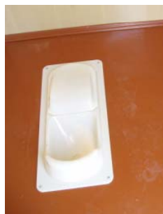
Slab of plastic made in China