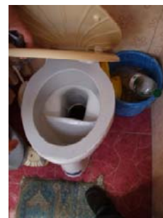
Ceramic datcha model with plastic UDD device (separett Sweden)