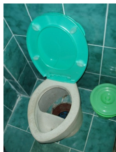
Made of concrete (Mexican mould) by company