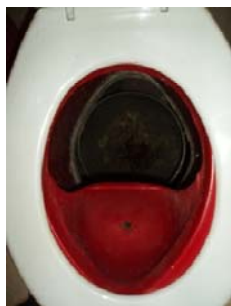
Made of concrete (Mexican mould) and painted by local partner