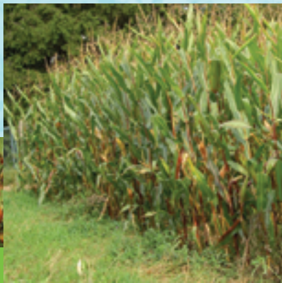
Urine is an excellent fertiliser. Composted faeces are excellent soil conditioners

The benefits of dry urine diverting ecosan toilets are their high quality and comfort, which is similar to water flush toilets. Because of the separation system, the ecosan toilets do not smell and do not attract flies. Consequently ecosan toilets can be built inside homes where it is warm and comfortable. Furthermore, ecosan toilets are cheaper to build than water-flush toilets. They do not need a connection to a water supply and sewage system and do not need pumps to supply water for flushing.