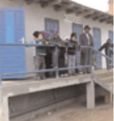
Dry urine diverting toilet building for the school in a Romanian village