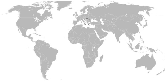
Fig. 1: Project location