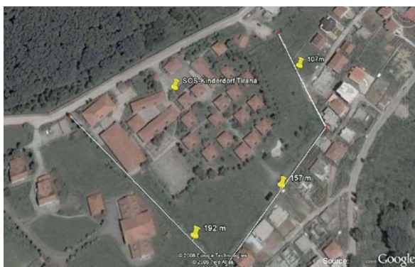
Fig. 4: Aerial view of the SOS Children's Village in Sauk (Google, Oct. 2008)

In Tirana, the capital of Albania, untreated sewage is discharged into the Lana River. So far, the public sewer system does not cover the suburban areas. For peri-urban and rural areas the most common means of sewage disposal are seepage pits. In these facilities the solids are kept back, while the wastewater infiltrates into the ground where groundwater is contaminated by the nutrients and pathogens of the wastewater. The SOS Children's Village is located in Sauk, a suburb of Tirana, without connection to the municipality's sewerage system, therefore a decentralised solution was required.