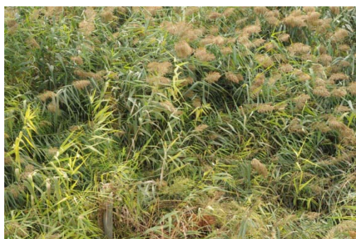
Fig. 8: View on the grown plants in the horizontal bed.