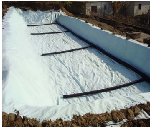
Fig. 6: Lining and drainage piping of Filter Bed IA during construction, before filling with gravel and sand.

Filter bed I is divided into two separate compartments, which can be operated independently. Each bed has a surface area of 165 m 2 . The media in which the reeds are planted is primarily sand (sand comes from Tirana; size 0-2 mm, 5 \cdot 10^{-4} < k_f < 5 \cdot 10^{-3} , it has to be noted that finer sand was recommended but not available), with a network of perforated collection pipes in the bottom covered by gravel. The depth of the bed is 0.6 m. Additionally, there is the provision of 0.3 m of freeboard. The bed is sealed at the bottom using a geo-membrane (polyethylene liner) towards the soil. The gravel layers in the bed are protected by geo-textile. A geo-textile is not usually recommended, see Hoffmann et al. (2011). The beds are fed alternately: One is fed for one week and then remains out of service for one week and recovers during this time. (One bed is fed for one week and then remains out of service for another week to recover while the other bed is used.)