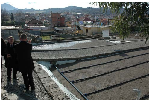
Fig. 7: Filter bed IB at inauguration with the minister of MPWT/ GDWSS. Reeds have not yet grown.

The distribution of the wastewater takes place by distribution pipes that are perforated with 8 mm holes in spaces of less than 1 meter on two sides. The 65 mm pipes are fixed on stone slabs and laid parallel lengthwise at 2 m distance. The collection system at the bottom of the bed is composed of perforated PVC pipes covered with gravel. The complete discharge is lead into the outlet sump. The ends of the perforated pipes are extended into the atmosphere, at one side of the cell, for flushing in case of clogging, and to prevent vacuum conditions at the bottom layer.