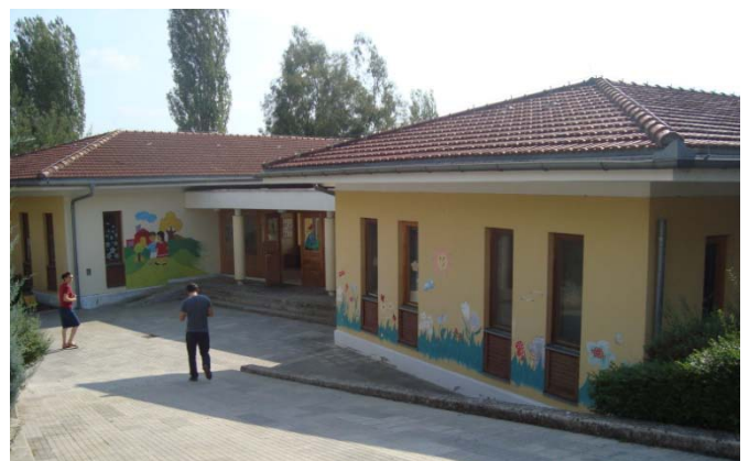
Fig. 3: Elementary School of the SOS Children's Village in Sauk, a suburb of Tirana (GTZ Tirana, Sept. 2010)

Within the project on "Advice on the Decentralisation of the Water and Sewerage Sector in Albania", which is financed by BMZ (German Federal Ministry for Economic Cooperation and Development), the GIZ and MPWT (Albanian Ministry of Public Works and Transport) initiated the pilot constructed wetland to raise awareness for low cost, appropriate and decentralised sanitation technologies in line with EU standards. It is aimed to be used as a model treatment plant by the main actors of the sector for training, demonstration, research and replication in peri-urban and rural areas of Albania.