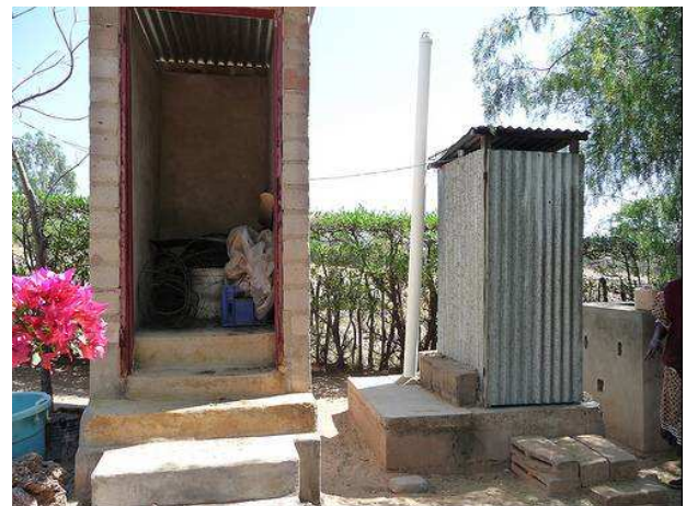
Fig. 9: UDDT (on the left) next to a pit latrine on the right (in Paje). The UDDT was never used since its installation in 2004 (as the main female of the household objects to having to empty the faeces container). The pre-existing pit latrine is used instead (when it is full, a new pit will be dug).

In Paje, those families that already had pit latrines were not motivated to maintain a UDDT in the long-run. In all cases where two toilets were found on the same plot, the pit latrine was used and family members said that they either did not know how to handle the faeces and/or considered it to be 'yucky'. The parallel structures seem to account for an unwillingness to maintain the UDDT, in some cases because the decision to make a new toilet had not been taken by the woman who usually maintained the UDDT.