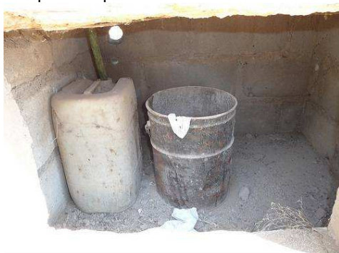
Fig. 6: Collection chamber under a properly working ecosan UDDT toilet (left: urine container, right: faeces bucket) in Paje.

Greywater (used household wastewater) is often collected and applied directly to the trees etc. This practice was further supported by the project. The greywater was also used to keep the compost heaps moist.