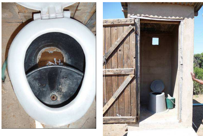
Fig. 7: Left: UDD toilet working properly in West Hanahai. Right: This UDDT was well maintained, ash standing next to the toilet and composting unit filled (in Paje).