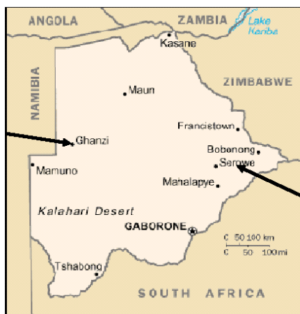
Fig. 4: Location of Paje Village (right arrow) and East and West Hanahai settlements (left arrow).

The relatively recent activities of livestock rearing and arable farming remain difficult to implement in the sandy soil and the extremely dry climate of the Kalahari Desert. The groundwater table is very deep, there is no permanent surface water, and households rely on reticulated water supply, mainly through public standpipes.