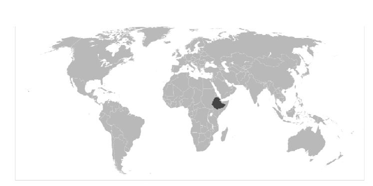
Fig. 1: Project location

Case study of sustainable sanitation projects Arborloo for household sanitation Arba Minch, Ethiopia