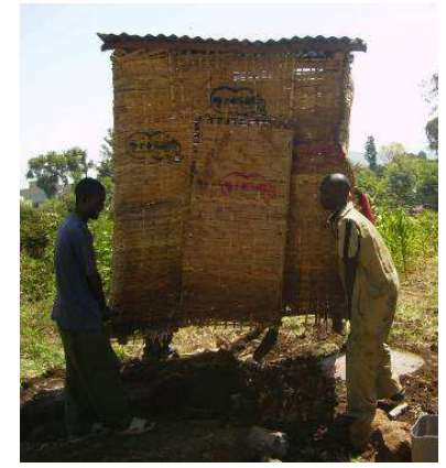
Fig. 3: Portable toilet house

In this type of toilet urine is not separated from faeces. Three cups of soil and one cup of ash are added after every use. When the Arborloo pit is full, the parts of the toilet are moved to another place, rebuilt and used in the same way again (refer Fig. 3). A thick layer of soil is placed over the filled pit. A young tree is planted in this soil and is watered and cared for (refer Fig. 4). The content will decompose by different biological processes over time and utilized by the planted tree.