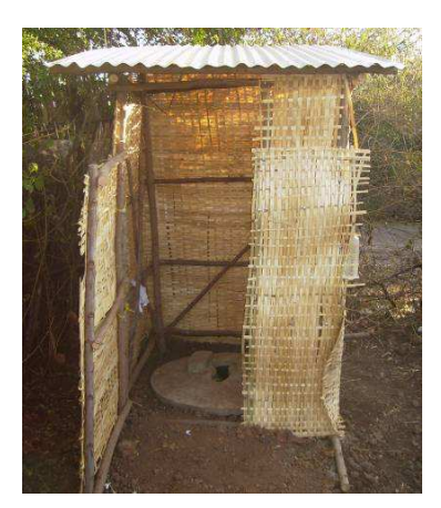
Fig. 7: Typical Arborloo toilet house

Easily movable shelter is placed on top of the pit. In most of the Arborloos, the material used for the superstructure is a locally available and cheap material called 'karta' which is made of woven bamboo (refer Fig. 7).