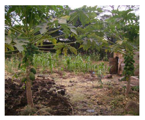
Fig. 4: Papayas grown on filled Arborloo pit (source: ROSA Project Arba Minch, 2008)

Fig. 3: Portable toilet house (source: ROSA Project Arba Minch, 2008)