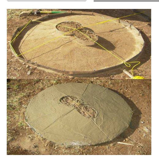
Fig. 6: Arborloo slab construction