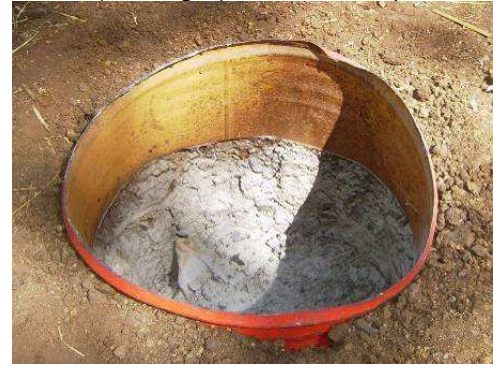
Fig. 5: Arborloo pit protection

To prevent a pit from collapsing, a sheet metal or a half barrel is used (refer Fig. 5). In stable soils protection was not used.