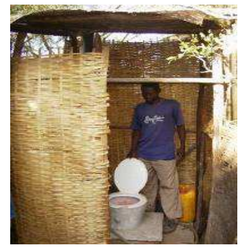
Fig. 3: Fossa alterna with urine diversion

Arba Minch town has an estimated population of about 80,000 with 4.5% annual growth rate. It is located 500 km south of Addis Ababa in southern Ethiopia.