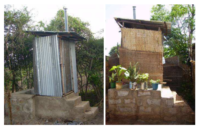
Fig. 7: Fossa alternas above ground

In cases where digging even a shallow pit is difficult, Fossa alternas can be constructed above ground (refer Fig. 7.).