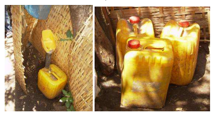
Fig. 9: Waterless urinal.

of customers who urinate in the Fossa alterna are a lot. Therefore, upon her request, a waterless urinal was installed. The filling rate is high (2 to 4 jerry cans per week). She changes the filled jerry cans by herself. She is paying Eur 5 per month for transporting the urine to a micro and small enterprise called 'Wubet le Arba Minch' Solid Waste Collectors Association for transporting the urine and for using it as a fertilizer. Refer Fig. 9. for the urinal installed in her compound.