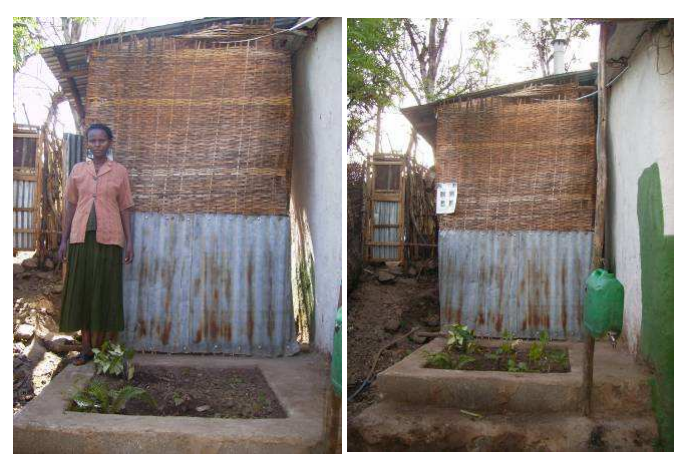
Fig. 8: Plants on the filled pit

Flowers or plants that can be harvested in 3 to 6 months can be grown on the filled pit while it is undergoing composting. One of the households planted plants on the filled pit (refer Fig. 8).