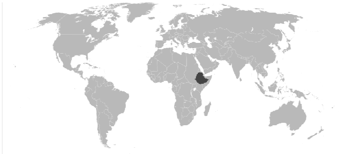
Fig. 1: Project location