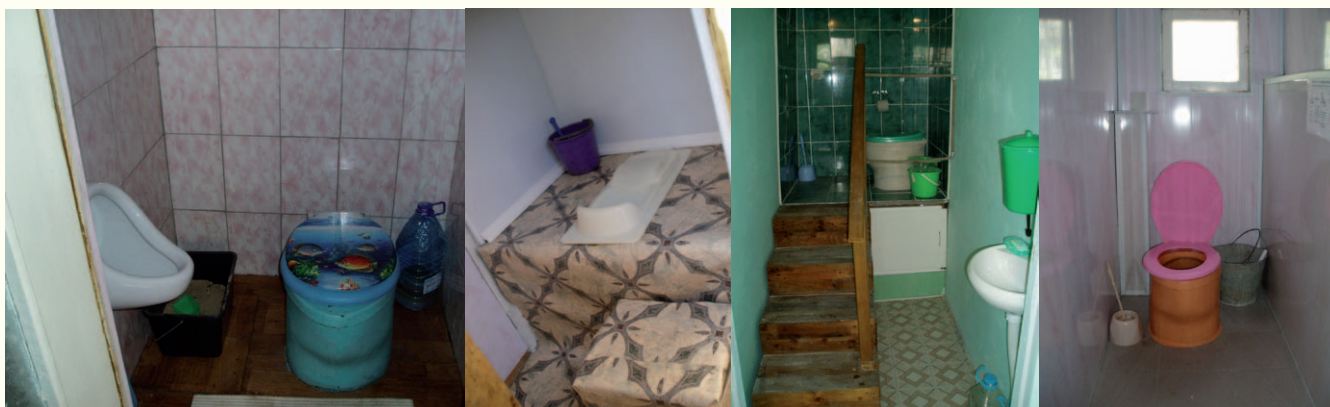
Figure 4: Indoor toilets