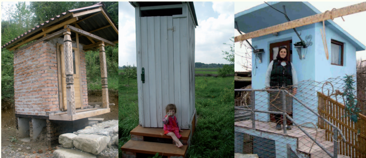
Figure 2: Outdoor toilets