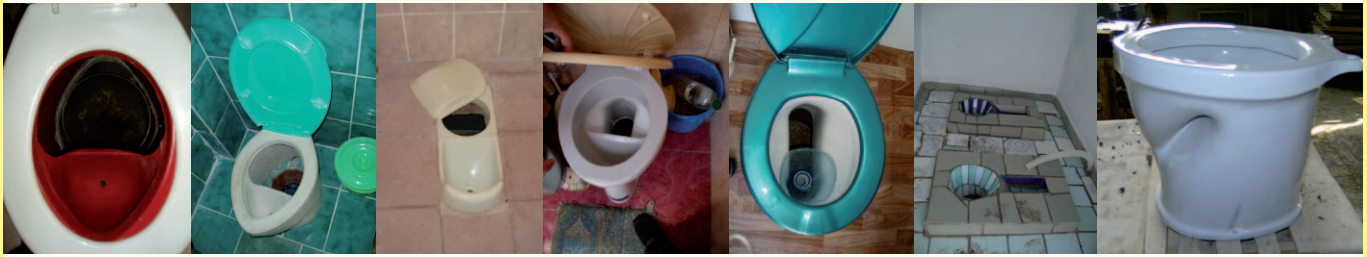
Figure 5: Different types of toilet model

was recently replicated for increasing the production. In Georgia, the factory production of ceramic UDDT interfaces was started in the frame of a WECF project. Another option is to use the ceramic dry toilet model which is available in most EECCA countries, so-called dacha model, and to insert a simple cut plastic bottle, a funnel or a plastic device for urine diversion, e.g. by the Swedish company Separett.