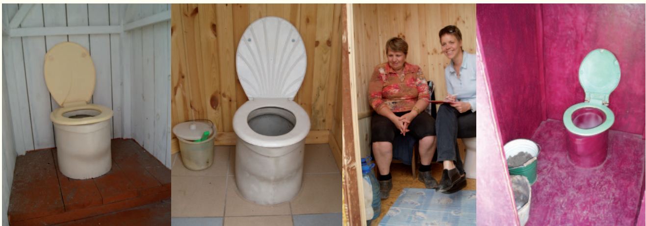
Figure 6: View into different toilet rooms

The standard of cleanliness, however, is not always satisfactory. A main reason is a lacking habit of toilet cleaning as people hardly clean their pit latrines.