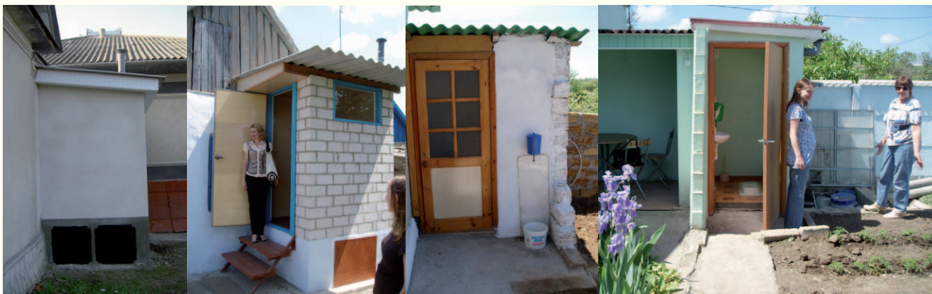
Figure 3: Toilets attached to the house