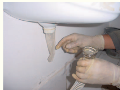
Figure 10: Smell stop (condom) in a boys’ urinal

to the toilets as possible. More detailed information about designs, no of rest rooms and other aspects can be found in (WECF, 2009b).