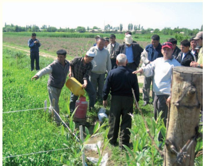
Figure 7: Agricultural workshop in Kyrgyzstan

Although the re-use of the sanitation products is not a subject in this paper, a proper training on the safe handling and re-use of urine and treated faeces is obligatory for a high sustainability of the projects. Hands-on application training is necessary to demonstrate the application of the products. It was shown that theoretical workshops are not sufficient because the application of human excreta is completely new to most beneficiaries and stakeholders in the EECCA countries. Here the saying “seeing is believing”, which is often used when smell free pilot UDD toilets are shown to stakeholders, is even more true. WECF also recommends the installation of demonstration gardens during these workshops to show the fertilizing effect of human excreta. They can be a real eye-opener and play a big role in convincing the people of the advantages of sustainable sanitation.