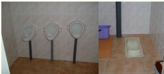
Figure 9: Boys’ urinals and rest room

A new school-building is the best opportunity to properly plan and design the infrastructure of the UDDT inside or attached. In most projects however the school building already exists and only the toilet facility is newly constructed. Then it is often possible to use intelligent planning or to retrofit a room that is not needed anymore such as a storage room. In other cases, it is possible to attach a new toilet building to the school and install a new door so that the children can directly enter into the new toilet. If there is no place available inside and no suitable place to attach the toilet, it should be implemented in the yard, as close to the exit of the school as possible to keep the distance short for the users. Hand wash facilities should optimally be installed in a separate room in front of the toilet rooms. Otherwise they should be as close