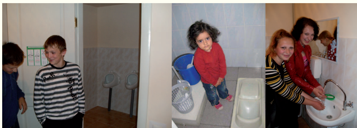
Figure 11: Examples of school sanitation facilities