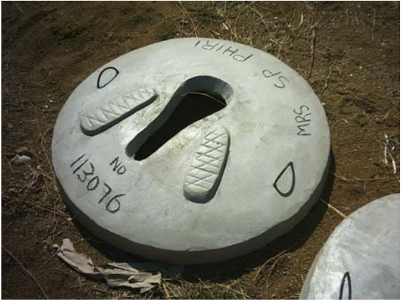
Domed slab made by mason in Embangweni

Several promotional methods are used to extend the knowledge of ecological sanitation in Malawi. The demonstration sites mentioned above are numerous and promote the concepts well. In the CCAP project, the project coordinator identifies local masons with an entrepreneurship background. Masons are trained in latrine slab making, ecological sanitation and marketing techniques.