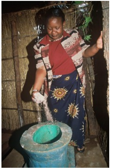
Adding ash to a Fossa alterna in Lichinga, Mozambique.

During the active implementation phase a parallel M&E programme was undertaken to assess whether systems were being used and managed properly. M&E surveys have been conducted every 3-4 months to see how the systems are being used. More recently this has changed to yearly surveys. Problem areas are identified at household level and across households.