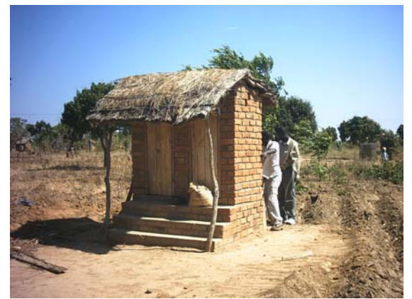
Urine diverting toilet in CCAP project Malawi

Since its advent in 2001, over 1500 low cost eco-toilets have been built in Embangweni with a further 300 units in Ekwendeni using this promotional method. Approximately three quarters of these are Arborloos . In the Salima project and surrounding areas some 500 units have been built – a mix of Arborloos and Fossa alterna . Very few urine diverting systems have been built, although the technology is on display in demo areas.