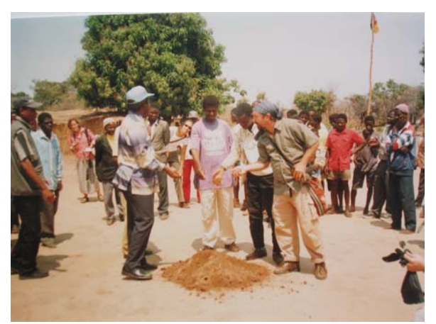
Inspecting toilet compost. Niassa Province, Mozambique.