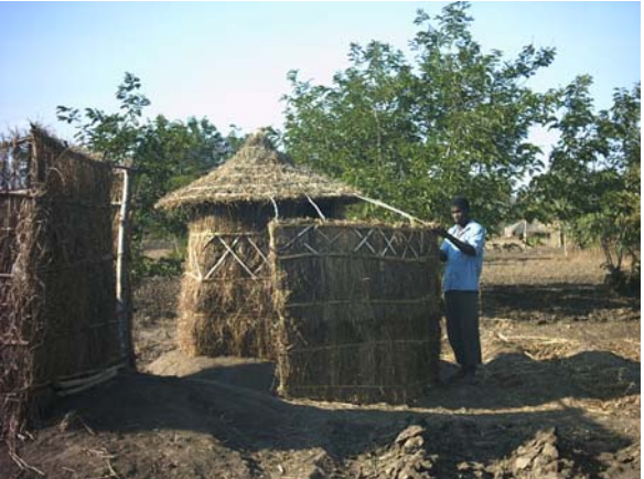
Completed Arborloo in Phalombe