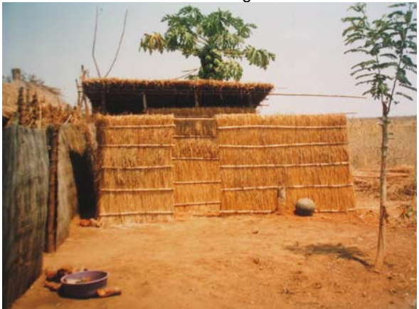
Fossa alterna, Niassa province, Mozambique

When the M&E programme was started, a number of problem areas were identified. First, a considerable number of households had odour problems because they were afraid to fill their pits too quickly and therefore were not including enough soil/ash after each use. They would put a small handful of ash/soil down the pit, which never covered the excrement. This behaviour has since been modified, and smells have been reduced or eliminated altogether.