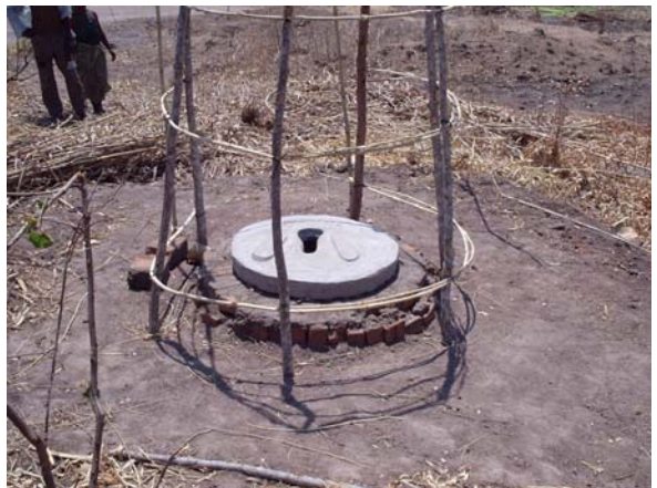
Slab mounted over pit with ring beam (Phalombe) Early stage for Arborloo

14 demonstration sites have been erected in Phalombe and 8 in Thyolo, where the various technologies are put on permanent display. The Arborloo, Fossa alterna and urine diverting technology are on display, as well as the improved traditional latrine. In Phalombe the technology of choice is the Arborloo, in Thyolo, the Fossa alterna . Hand washing facilities are also strongly promoted. Most of these are made by drilling holes in a plastic cup or tin and filling a reservoir nearby with water which is decanted into the dispenser.