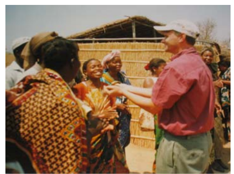
Explaining the merits of toilet compost to villagers

ESTAMOS held a series of meetings with community leaders and active residents in various Lichinga bairros. Sanitation issues were discussed and it emerged that participants had problems with their current latrines. Flies, smells and pit collapse seemed common. ESTAMOS then introduced EcoSan, as described above, as a possible alternative to consider.