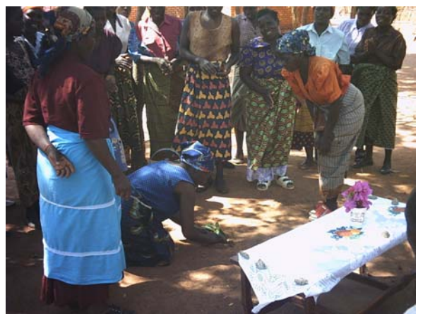
Drama used to promote eco-toilets and tree planting. Embangweni

The concept of the sanitation clubs also originated in the CCAP programme in Embangweni. The CCAP Synod of Livingstonia at Embangweni and Ekwendeni have acted as learning centres for many NGO's in Malawi. Many of the organisations, visiting projects sites bring chiefs, farmers and extension workers to CCAP before they start implementing their own programmes. Organizations that have learned from CCAP include COMWASH in Thyolo and Phalombe, Inter Aid, a French NGO based in Lilongwe, WESM based in Dwangwa in Nkhotatakota, CCAP Nkhoma Synod in the Central region of Malawi, Total Land Care in Kasungu and Dowa districts and of late Canadian Physician and Relief Organisation from Nkhatabay.