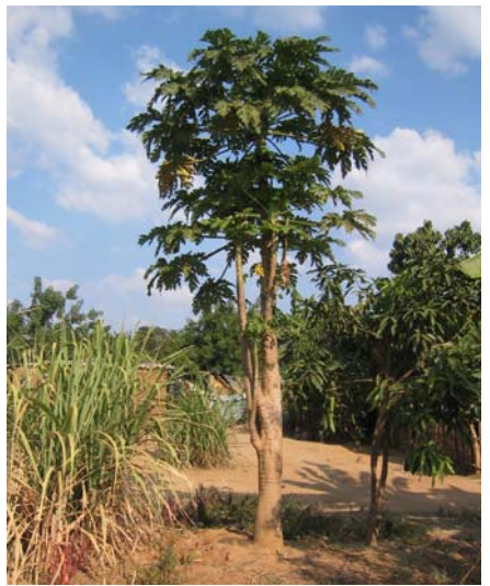
Most trees will grow well in abandoned toilet pits if cared for and watered. Here a fine paw paw tree grows in an old Arborloo pit in Zimbabwe.

Shallow pit composting technology is also used in the Fossa alterna concept, where two permanently sited shallow pits, each about 1.5 metres deep are used alternately. Once again soil, ash and if possible leaves are added to accelerate the rate of composting within the pit. Pits become easily excavated after a year of composting, making an annual pit change possible. The simple motto is more soil – less garbage! Compost suitable for the garden is thus produced every year. This is highly valuable, especially when mixed in equal proportions with very poor soil almost devoid of nutrients – a common condition over much of Africa.