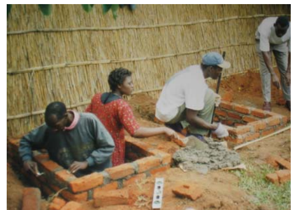
Training in making brick ring beams. WaterAid. Lilongwe

WaterAid (UK) started promoting ecological sanitation in Malawi in 2001 and initiated a project in Salima. Training programmes were also held in Lilongwe and the concept of ecosan was promoted nationally. WaterAid also financially supported an ecosan programme undertaken by the Development Department of the CCAP (Church of Central Africa Presbyterian), Synod of Livingstonia, in Embangweni. The CCAP has also extended its operations to Ekwendeni operating in the outskirts of Mzuzu City in Northern Malawi WaterAid support has also been provided for a project in Dwangwa.