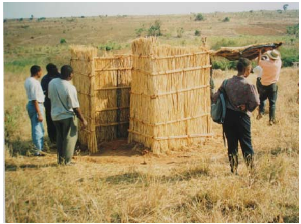
Grass structure being built in Lichinga, Mozambique

The total number of latrines built in Niassa supported programmes over the last 4 years is 1,261, of which 10 are public latrines, 3 are Arborloo's , 6 are improved traditional latrines, 540 are SanPlats and the rest (702) are Fossa alterna . WaterAid also supports sanitation work in Zambézia province using similar methods. Here direct or indirect support has led to the construction of a further 375 Fossa alterna , 24 traditional latrines and 395 Sanplat/Melhorada latrines. 15 urine diverting toilets have also been built in Maputo under this programme at a cost of US$200 each, which is deemed unreasonable to sustain, so alternatives are being considered.