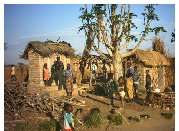
Ecological toilets in Northern Malawi

Records for intestinal worm ( Ascaris ) cases analysed in Embangweni hospital were higher in 2002 than in 2003.The reduction in the number of cases could be due to several different reasons. One of the major reasons is the intervention by various programmes operating within Embangweni mission hospital catchment area that includes the sanitation programme, Child survival and shallow well programmes. Though some quarters have shown reservations to the use of Fossa alterna contents after six months, cases of worm infection or diarrhoeal disease out break have not been reported from families using the material.