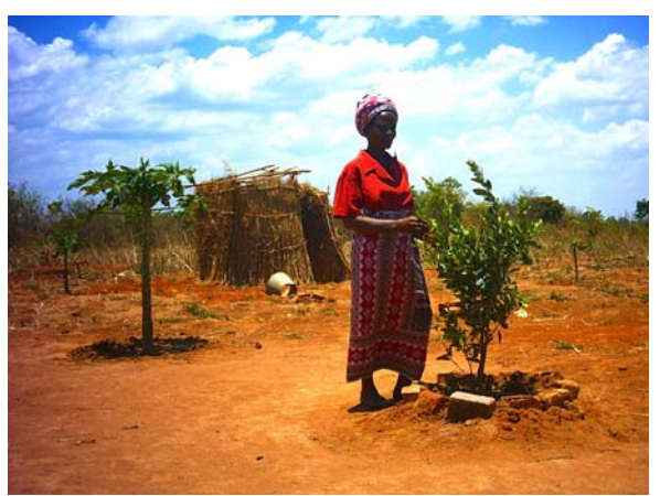
Growing fruit trees, Embangweni

An Arborloo is the simplest of all eco san latrines designed because it requires the least amount of behaviour change. Many families tend to build this type of latrine first, when they are convinced of eco sanitation. This creates a demand of fruit seedlings among households. For most the Arborloo is the entry point for ecological sanitation.