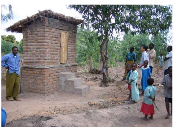
Urine diverting toilet in Phalombe

Urine diverting toilets (Skyloo) were built in smaller numbers mostly by business people with more money to spend. The urine diverting system is normally built in permanent brick and mortar which makes it more attractive and prestigious, but also costs more than most villagers can afford. The Arborloo was the most popular followed by the Fossa alterna . A total of 788 hand washing facilities had also been built, greatly increasing the hygienic aspect of the programme. Throughout the two districts a total of 22 demonstration centres had been built (Elias Chimulambe pers.comm). This is an impressive piece of work by any standards.