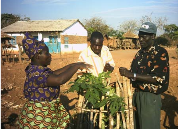
Inspecting paw paw tree growing on Arborloo pit. Embangweni

One of the households at Ephangweni, which, is within Embangweni area, has been using both urine and contents of an Arborloo to increase the growth of both banana and granadilla. This method is now being encouraged among households so that they can get quick results after planting a tree (report of Twitty Munkhondia). In Zimbabwe the application of diluted urine (2 litres urine + 10 litres water per week) produced a significant increase in growth on mulberry, banana and mango.