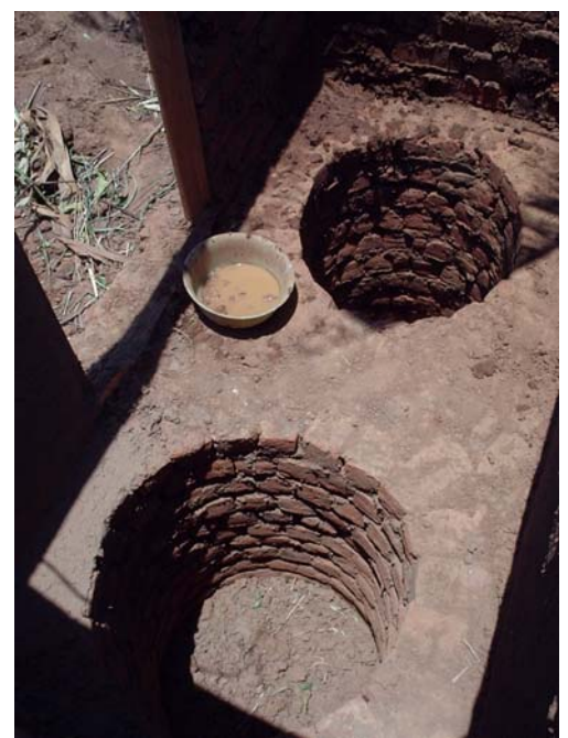
Twin pits in a Fossa alterna. Thyolo.