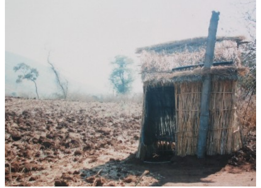
VIP latrines can also be low cost too! It works perfectly

Improvements in the pit toilet, like the SanPlat which offers a hygienic slab surface, or the VIP, which uses a screened vent pipe to overcome problems of odours and flies, are well known on the continent. The popularity of the VIP is mainly confined to Southern Africa, where donors have been prepared to offer relatively large subsidies to support programmes. For budget programmes, the SANPLAT system, principally a concrete slab placed over a protected pit, has been used far more widely throughout the continent. The main improvement being the hygienic surface on which people can squat. And compared to traditional latrines this is a big step forwards.