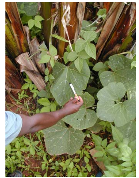
Pumpkin growing on Arborloo pit. WaterAid UK.