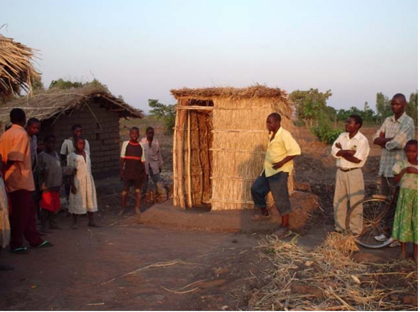
Arborloo on Phalombe plain, Malawi