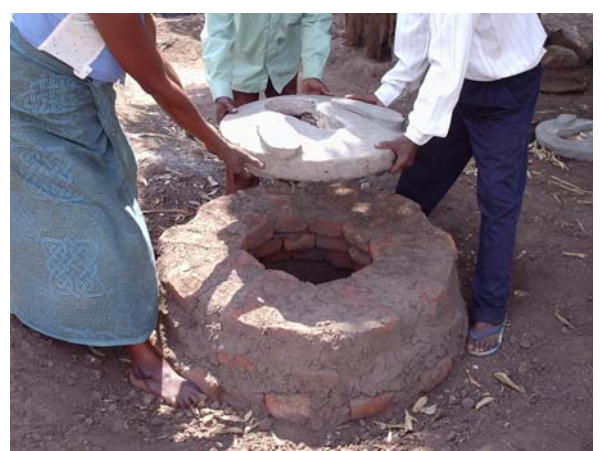
Installing small slab on bring ring beam for Arborloo

This operation was initiated in May 2003 with the first toilet constructions starting in September 2003. The project has made excellent progress since that time with 6740 eco-toilets being recorded by June 2005. The technology and concept of recycling and hygiene promotion are promoted through focussed group discussion by sanitation clubs in the village setting by Health Surveillance Assistants (MOH), who convene meetings with the villagers and headmen and in some cases the village Chiefs. Members of the club committees are elected. There is a link between the Sanitation Clubs and the Village Health Committees. The Sanitation clubs offer an avenue for the application for subsidised latrine slabs. The clubs in practice take a lead role, together with the masons, in the promotion of eco-toilets. Links are formed between the projects and the households. The clubs are also encouraged to apply for funds from the District Development Fund (ie outside COMWASH support) to encourage longer term sustainability of support. There are 301 sanitation clubs operating in Phalombe, and 104 in Thyolo. Normally a Health Surveillance Assistant looks after 3 villages.