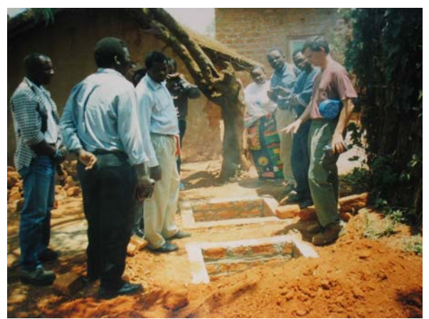
Training session in Lichinga, WaterAid, Mozambique

In terms of rural ecological sanitation in Niassa, EcoSan was first introduced into Maiaca, a rural village in Maúa. Maiaca participated in the DDOPH/DAS/WaterAid water supply programme in 2000, and the Chefe de Posto Administrativo was interested in exploring why diarrhoea was such a problem in the area (Breslin 2001).