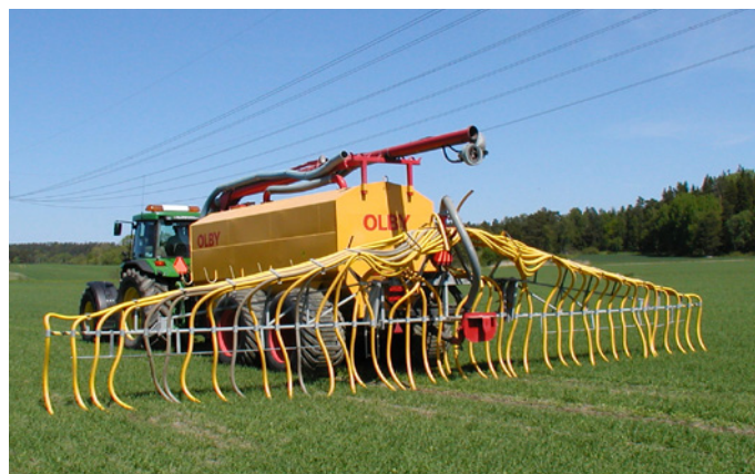
Figure 3. Applying sanitized urine as fertilizer in Bornsjön, Sweden

To increase reuse of nutrients on the municipal level, in 2010 the Swedish Environmental Protection Agency circulated a revised action plan for recycling phosphorus from wastewater. 11 The plan emphasizes the need for reuse, partly to prevent eutrophication and partly in recognition of the fact that the world’s phosphate reserves are dwindling, and that current practice for nutrient management is far from sustainable. However, there are strong actors in Sweden calling for the action plan to be broadened to also encompass the other nutrients in wastewater, since a one-sided focus on phosphorus may mean that efforts are less than optimal.