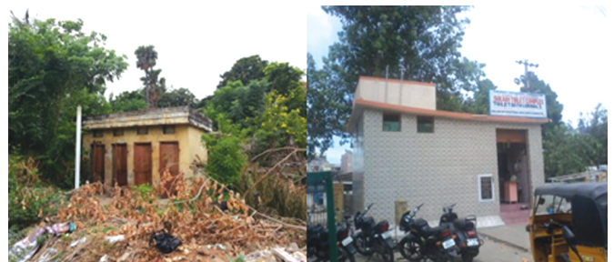
Public Toilets in Tirupati

The city of Tirupati is a religious and tourist hub with a floating population of upto 100.000 persons per day, hence providing good public toilet services is one of the most important interventions on the city's sanitation improvement agenda. Current efforts towards provision of public toilets in Tirupati are found to be still dependent on traditional models with low degree of success and high probability of becoming defunct.