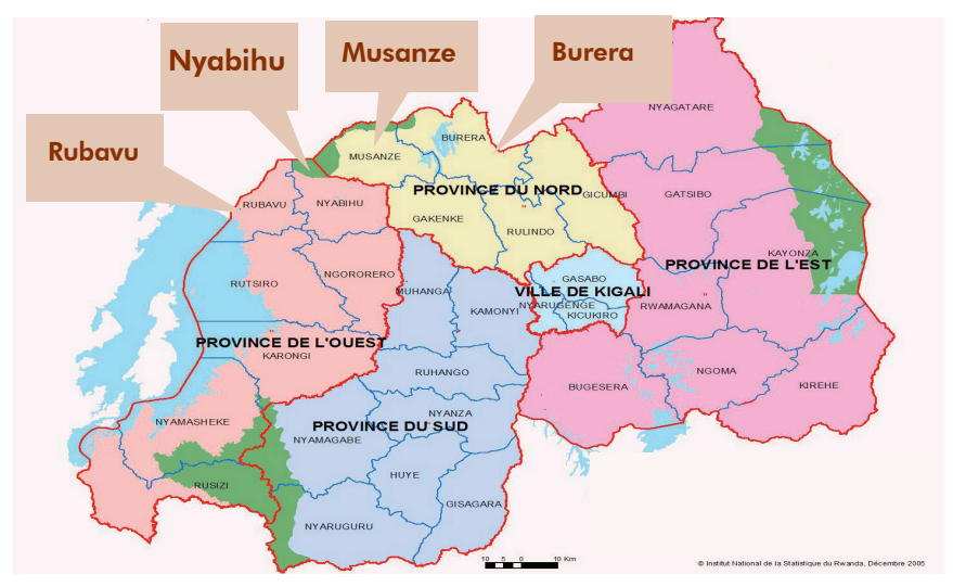
Figure 1: Map of Rwanda showing districts where the WASH project has been implemented

Economic Development and Poverty Reduction Strategy (ED-PRS). The strategy aims to increase the proportion of Rwandans with improved sanitation and hygiene services, and also assigns roles and responsibilities to different stakeholders, including NGOs (e.g. World Vision, SNV) and the private sector (e.g. Aqua-san Limited). Figure 2 presents the roles and responsibilities of the stakeholders in the water, sanitation and hygiene (WASH) sector.