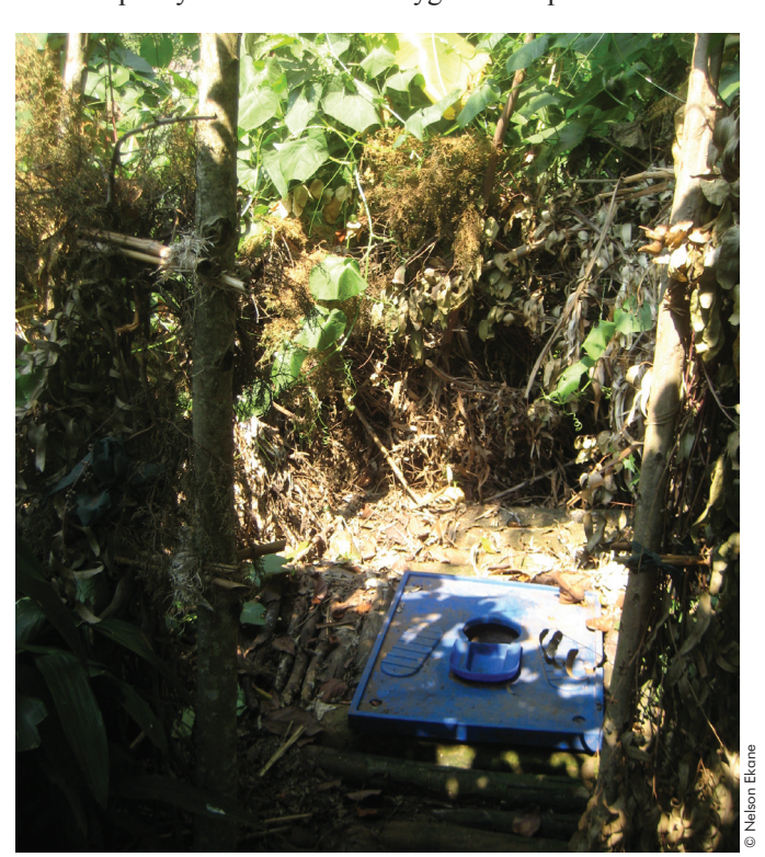
A UDDT toilet in Burera district, Rwanda

A coherent national policy on sanitation and hygiene is critical for raising the profile of the sanitation and hygiene sector and for improving access to safe and hygienic sanitation facilities. However, policy alone is not adequate. In Rwanda, like many other developing countries, it remains a mammoth challenge to translate policy on sanitation and hygiene into practice.