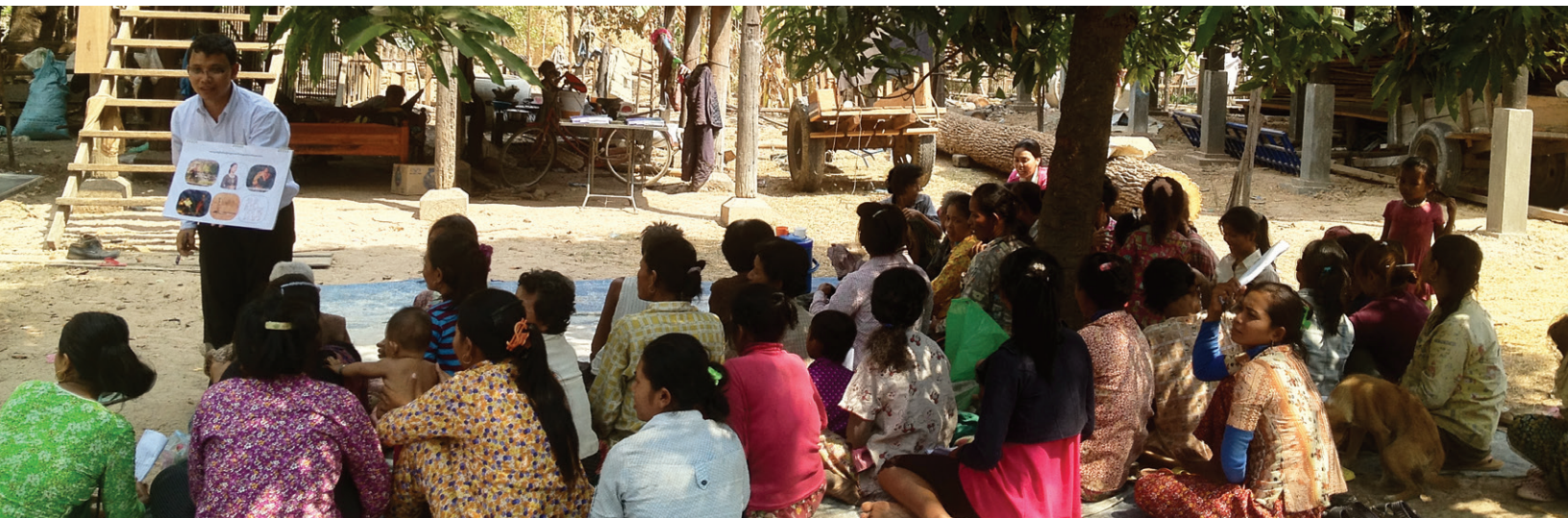
Potential clients at a village sanitation meeting

Timely delivery of results. By focusing on an outcome indicator (purchase of latrines) that changed quickly, was easily observable, and was tightly linked with an ultimate outcome of interest (increased access to sanitation), actionable results were delivered to decision-makers within 3 months of starting the study.