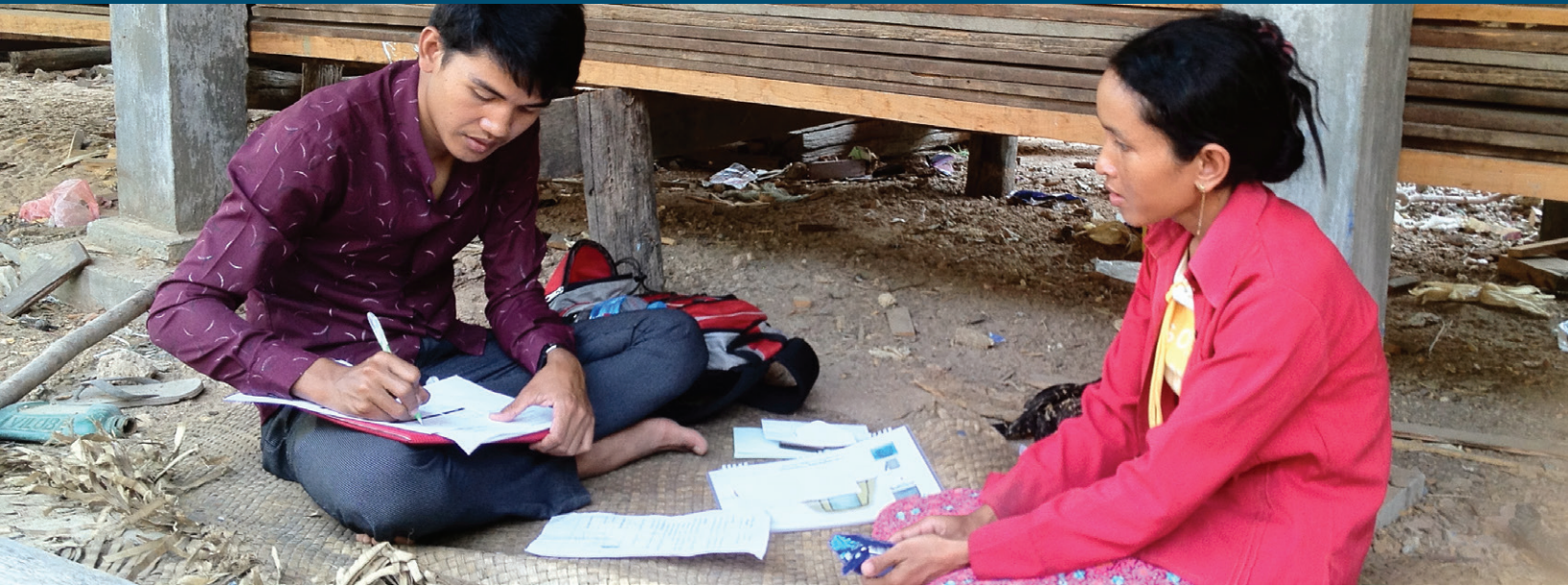
Sales agent finalizing a latrine sale with a customer

Evidence from a randomized trial in rural Cambodia