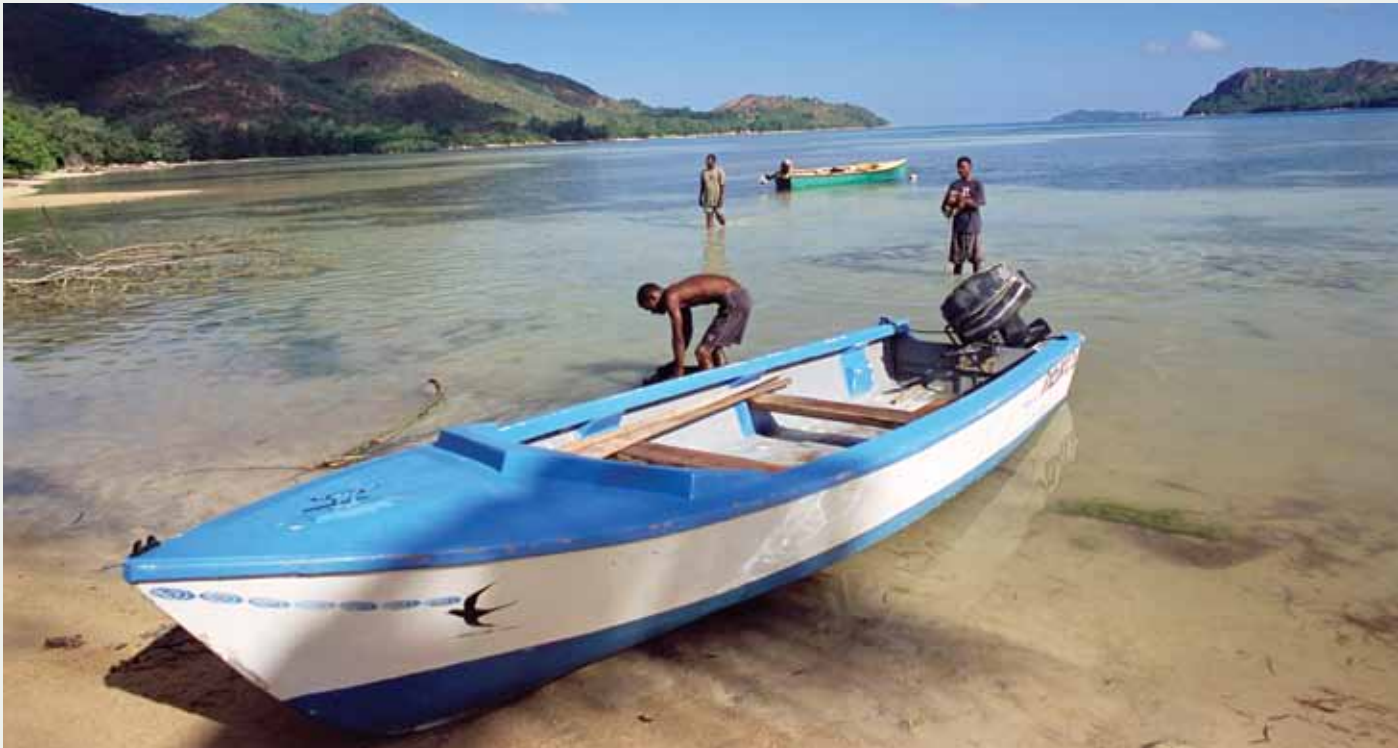
Grand Anse, south coast, island of Praslin, Seychelles, Indian Ocean, Africa.

Hunnan, P. and U. Piest, 2006. National Capacity Self-Assessment: Global Progress, Synthesis Report and Emerging Lessons . Global Support Programme (GSP), UNDP/UNEP/GEF GSP Capacity Development News , No. 2, 3 and 5, 2005-2006 (All quotes from Hunnan and Piest, 2006. Emerging Lessons )