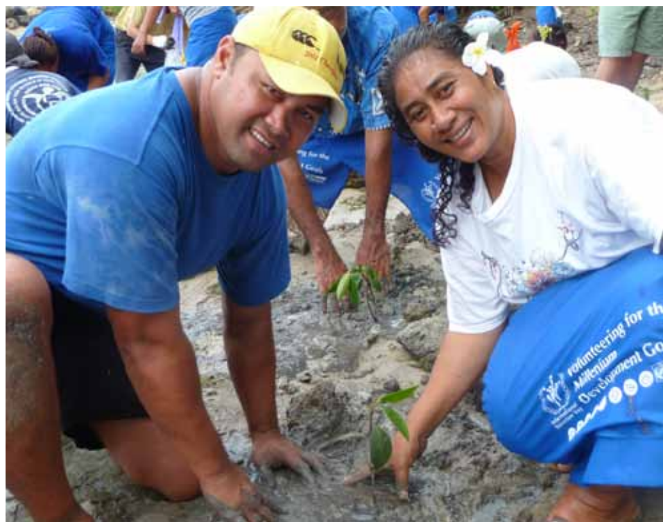
Two volunteers from different communities sharing a moment of joy after planting together a mangrove seedling as part of a community-based adaptation project.

Experience has shown the value of prioritizing “early and often” during the CDES process. Capacity assessment can lead to a long “wish list” of needs due to the chronic scarcity of resources to address environmental challenges. Prioritization techniques should be used to identify key limiting factors that would, if addressed, leverage significant improvements in capacity to address the most pressing ES issues, as identified in national and local strategies and plans. 25 Section 5 discusses several “Core Issues” that are commonly explored during capacity assessment.