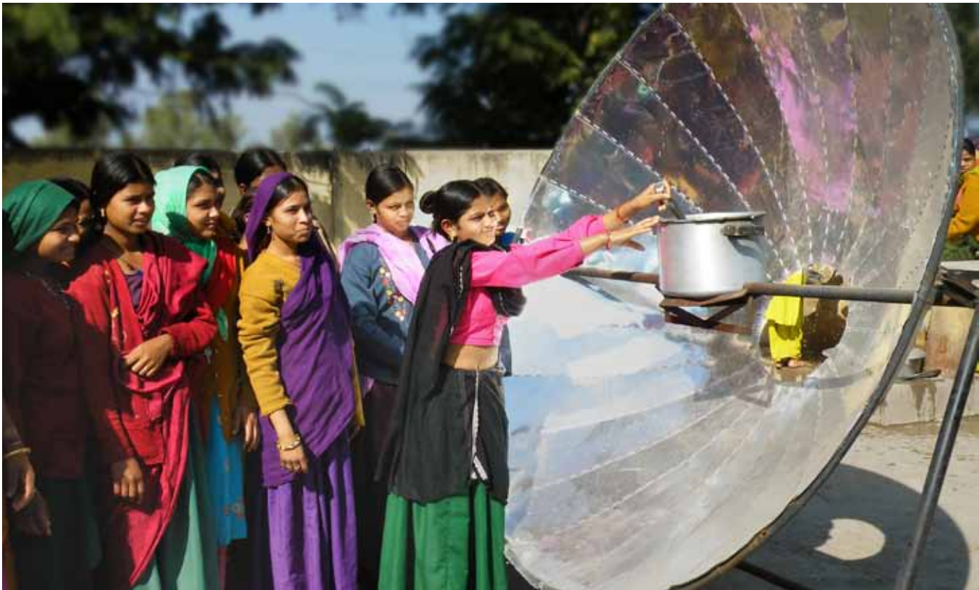
A group of young women in India learn how use a solar dish for cooking.

The list in Box 5 is expanded in Annex A, Tool #2, which shows sub-topics (or “sub-capacities”) for each of the seventeen key capacities. The expanded list is intended to highlight the spectrum of the capacities that a society needs to achieve its environmental sustainability goals. Tool #2 can be used at various steps in capacity development, as suggested in the introduction to the tool. For example, it can be used as a checklist to identify capacity assets and needs and/or to choose priorities for capacity development. A particular initiative will likely focus on one more of the capacities and sub-capacities, depending on its purpose and scope.