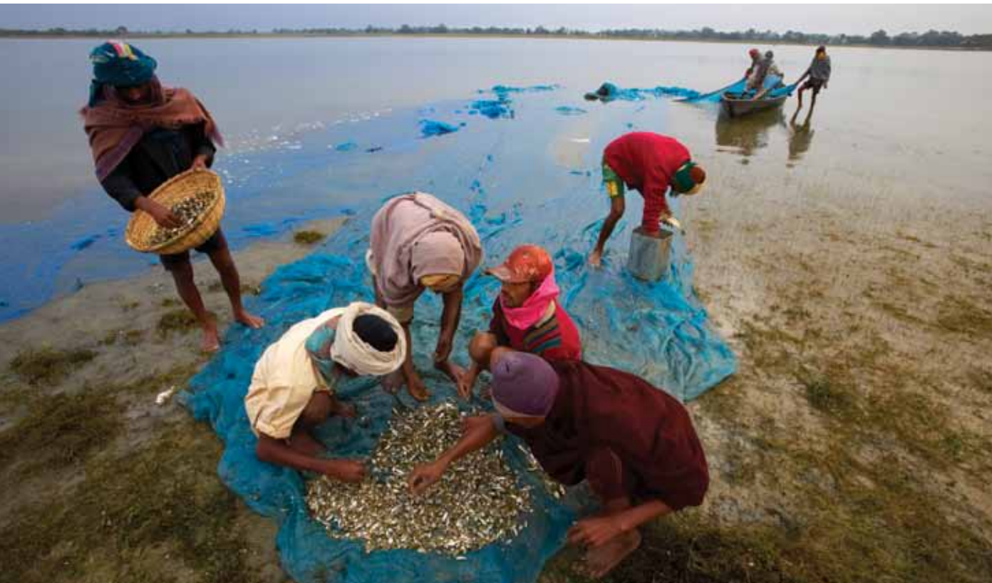
Fishermen pulling up a catch in a fine masked fishing net on the shores of the Brahmaputra River. Indian Sub-Continent, India, Assam, Tezpur.

UNDP’s overall approach to supporting capacity development is based on ten guiding principles (UNDP, 2008a). The agency’s approach to CDES complements these with Guiding Principles for CDES, as derived from global experience (Box 3).