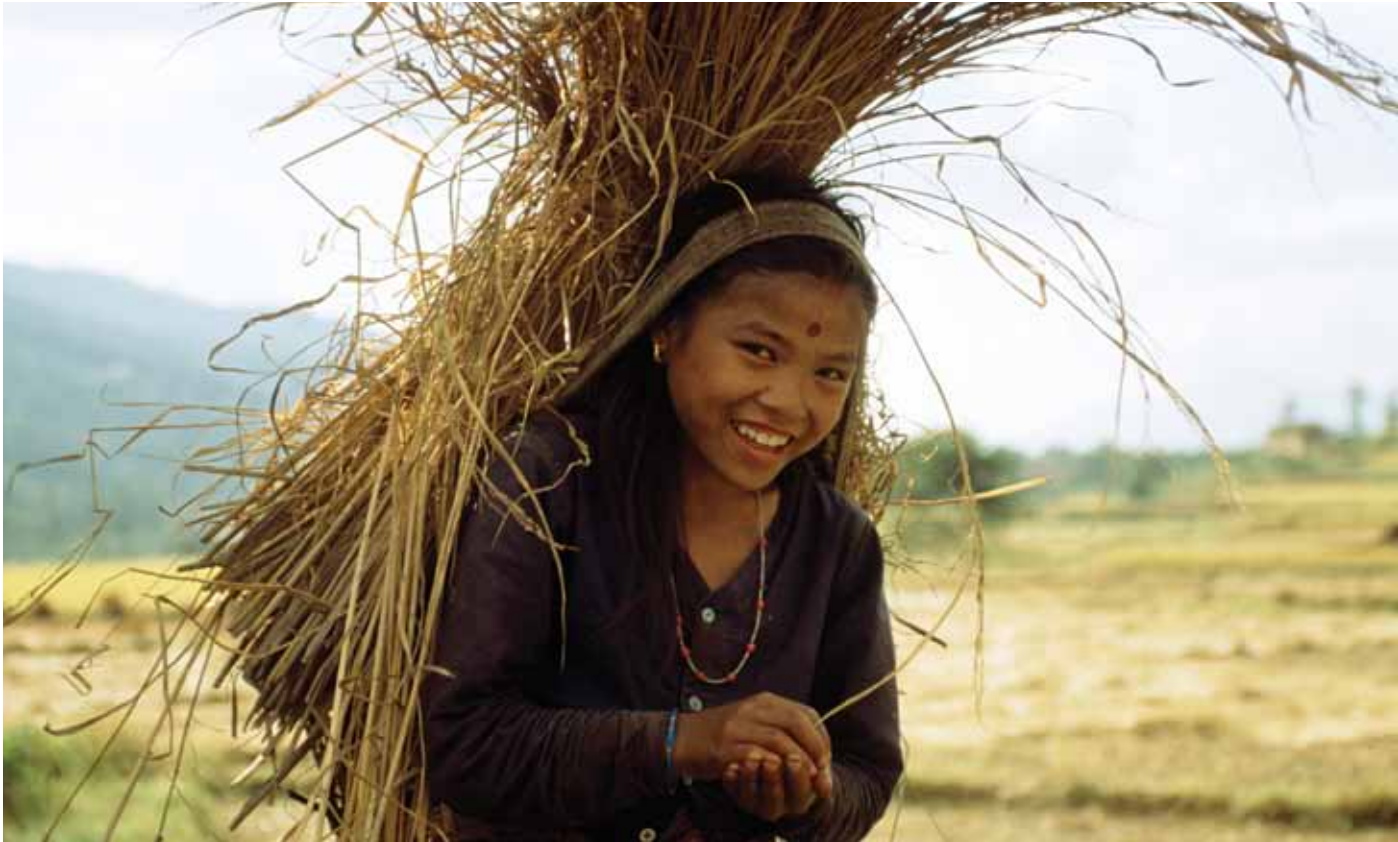
Young woman carrying sheaf of rice Nepal, Kathmandu Valley, Sankhu village.

UNDP’s analytical framework for CDES recognises three levels of capacity – the individual, the organisation and the enabling environment (or “system level”), which includes the political, social, economic, policy, legal and regulatory systems within which organisations and individuals operate. The framework also identifies key capacities that can be strengthened in order to achieve specific environmental sustainability goals. These include functional capacities needed to undertake the core functions involved in implementing CDES initiatives, including capacities to: