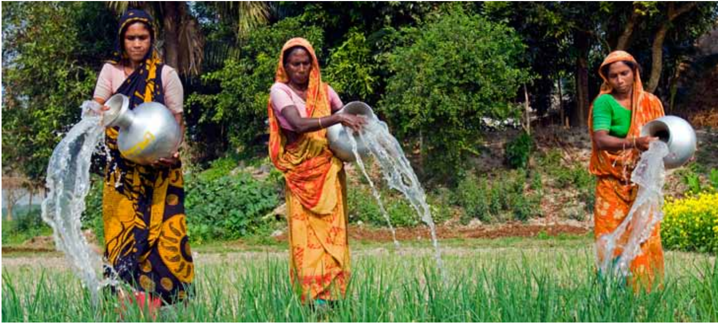
Farmers irrigating a field in Bangladesh.