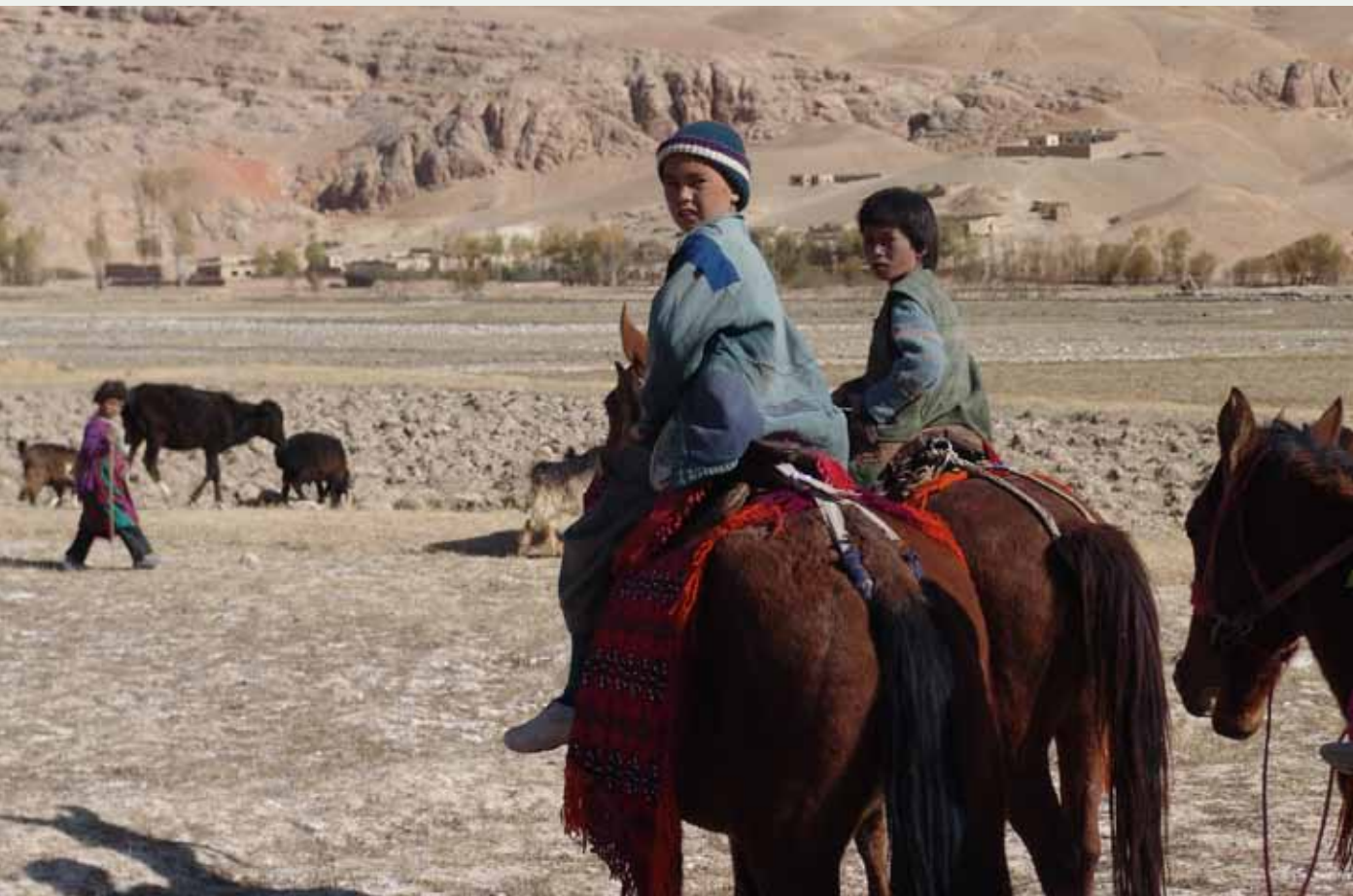
Caption: Young herders in Yakawlang Valley, Bamyan Province Afghanistan.