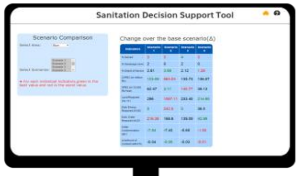
Screen 5- Scenario Comparison