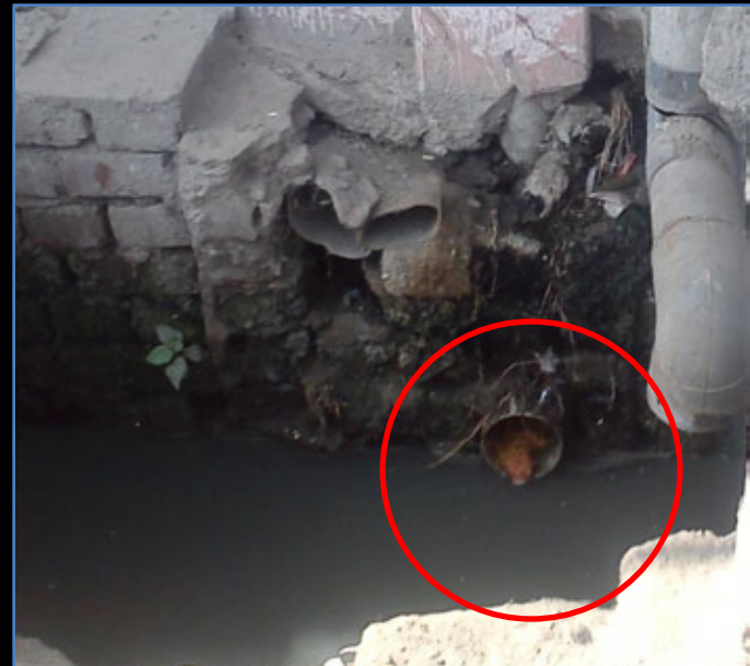
Excreta outflows to open drains in Delhi