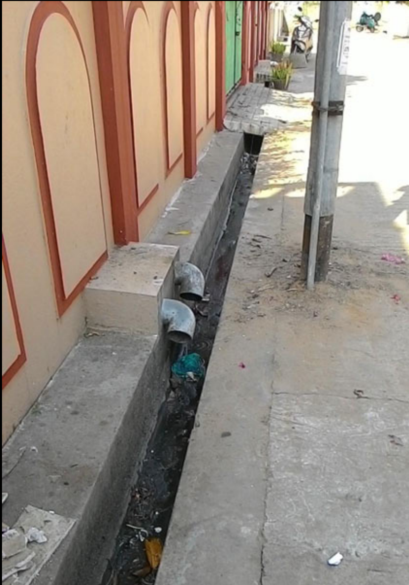
Effluent from septic tank discharged in open drain, Srikakulam, AP