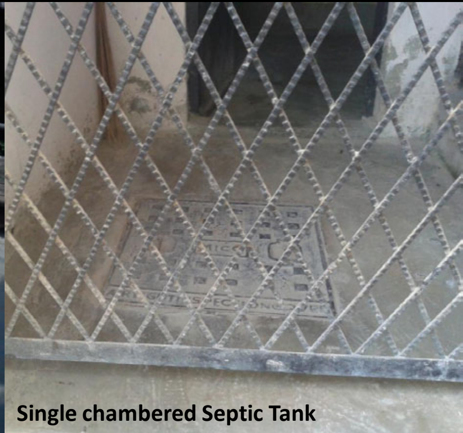
Single chambered Septic Tank