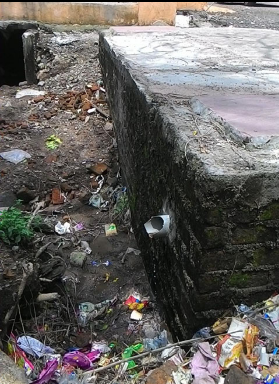
Septic Tank of a public toilet in Dewas