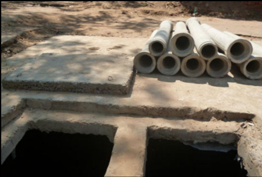
Community septic tank, Tajganj, Agra