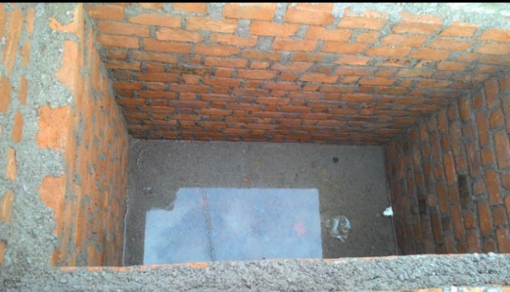
Septic Tank in construction phase, Dewas M.P