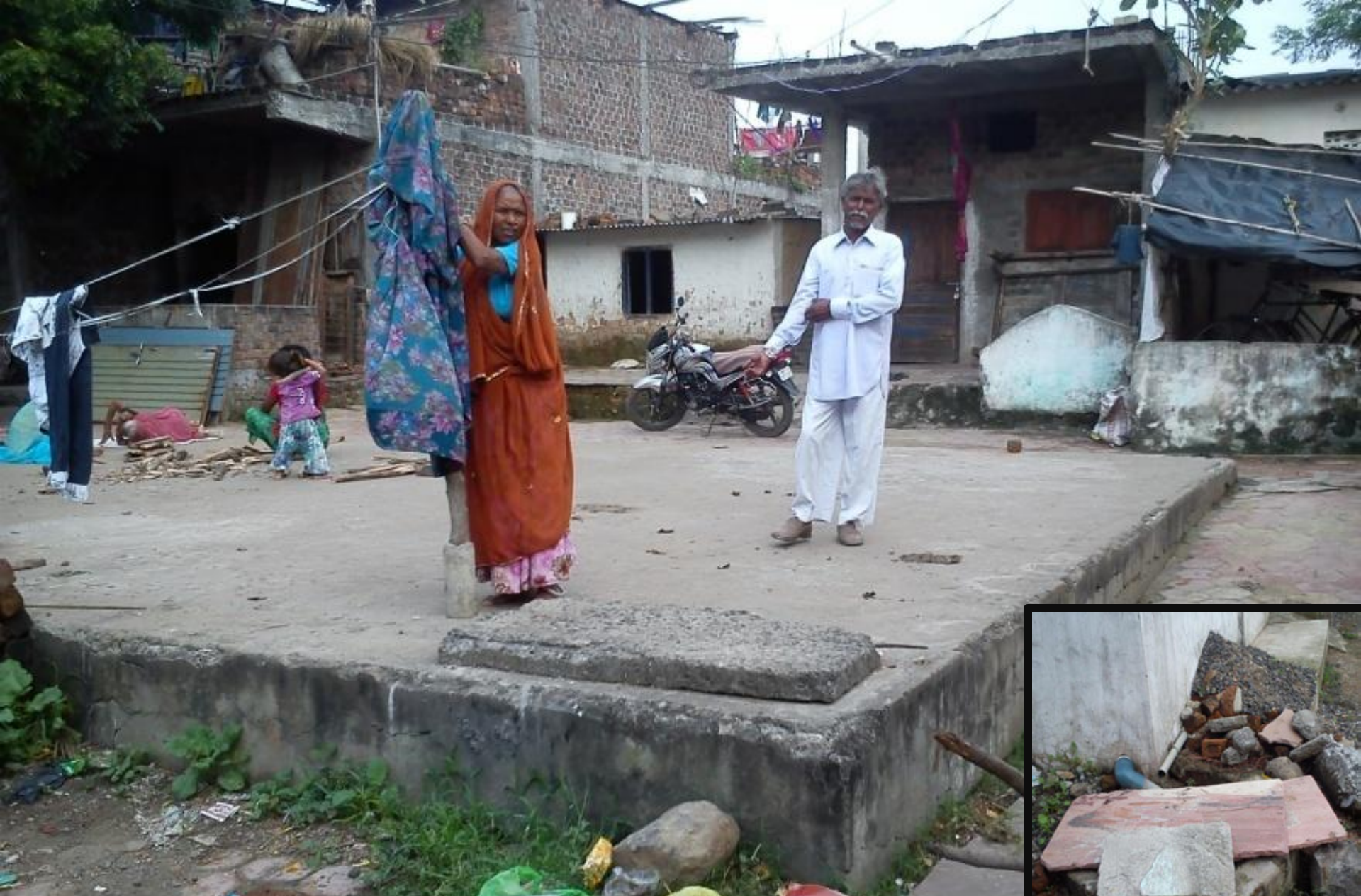
Community Septic Tank connected to households via chambers. (Dewas, M.P)