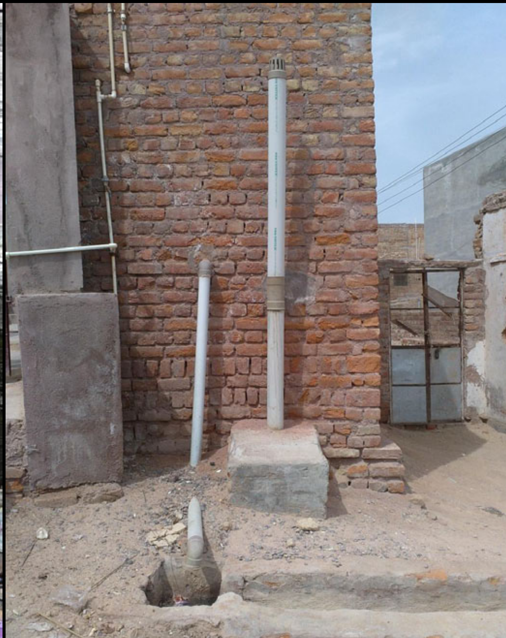
A vent pipe connected to Kuiti, in Bikaner