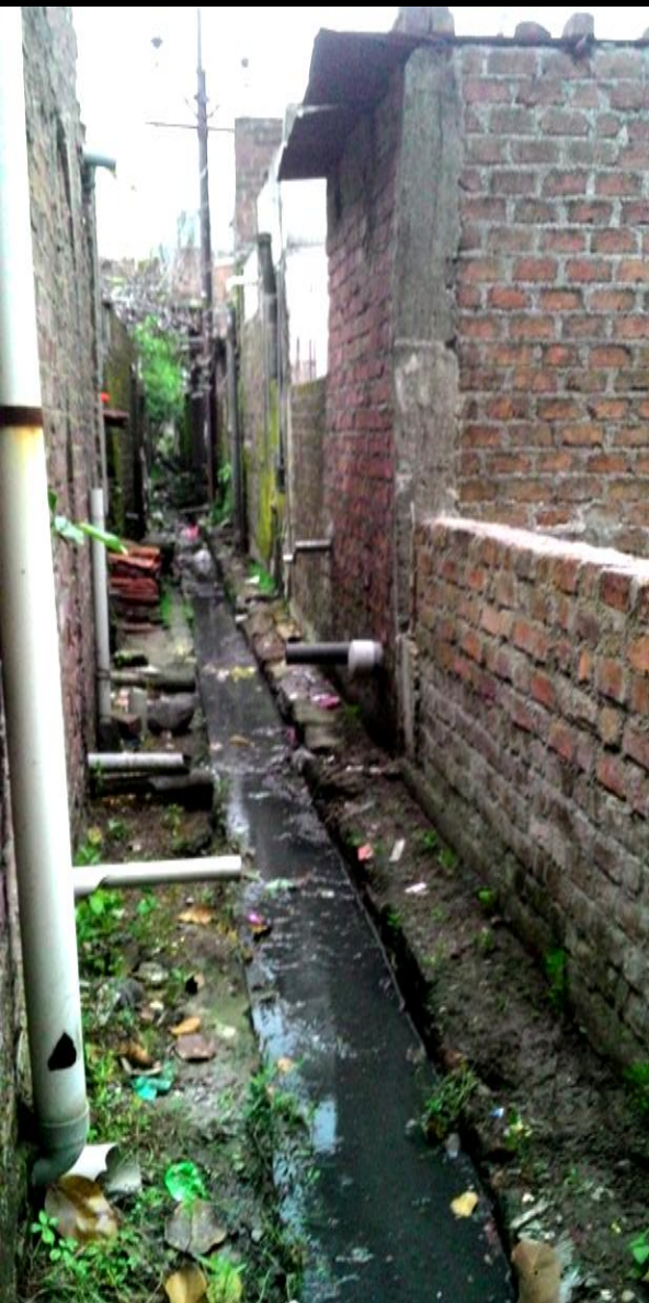
Effluent from septic tanks discharged in the backyard of households in Dewas, MP