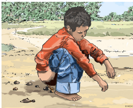
Boy squatting.

Those less able to construct and maintain toilets may, unless helped, continue or lapse into, OD (Cavil et al, forthcoming). In many contexts, young children's faeces are considered relatively harmless and not disposed of hygienically. The safe disposal of child faeces is a huge topic and one that has until recently been largely overlooked in research, policy and programme interventions (WSP 2015). Case-studies in 26 locations across Africa, Asia, the Pacific and the Caribbean found that all countries reported some unsafe child faeces disposal among households with improved sanitation (WSP 2015). Elderly people's reluctance to abandon the habit of OD tends to be tolerated. For their part, disabled people may be unable to use toilets because of problems of access (see Wilbur and Jones 2014). Some people with mental health problems can be difficult to persuade or control and their continued OD accepted.