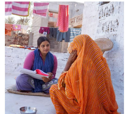
Women interviewed about sanitation practices as part of SQUAT survey in Rajasthan.

Four relevant studies have been carried out in Odisha. The percentages of those with a functioning toilet recorded as defecating in the open were 27 (Jenkins et al 2014), and 24 (defecating in the open in the previous 7 days) (Dreibelbis et al 2015). One study found 37 per cent of people with latrines never used them (Barnard et al 2013), while a randomised control trial found 37 per cent of latrines in the control group were not being used (Clasen et al 2014).