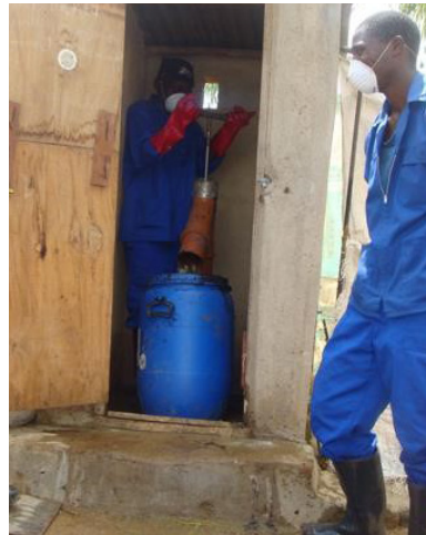
Gulper being used in Malawi.

The emptying, transportation and disposal of sludge from pit latrines can pose a significant health risk alongside organisational difficulties (Water Research Commission 2007). Covering pits and digging a new one can be a safe and hygienic FSM option. However, as mentioned above this is not always possible where there is little space or the soil type or topography makes digging a new pit expensive and difficult.