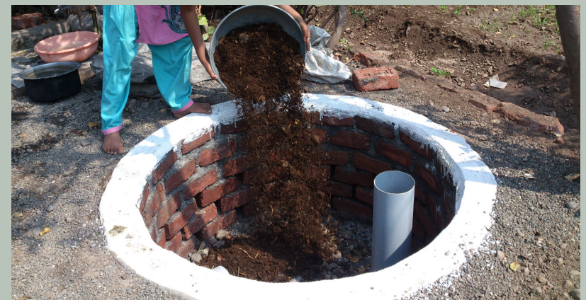
Tiger Toilet being installed, India.

For more information contact: c.furlong@lboro.ac.uk