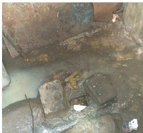
Dirty toilet in Mathare, Nairobi, Kenya, where an urban CLTS programme has taken place.

Dirty and disgusting toilets deter use, make them unpleasant to clean, and provoke reversion to OD. It has been argued that bad smell also presents an overlooked barrier to toilet adoption (Rheinländer et al 2013). In Northwest Ethiopia, households with hygienic toilets have been found over four times more likely to use them (Yimam et al 2014). Dirt and smell are notorious disincentives from using school and market toilets.