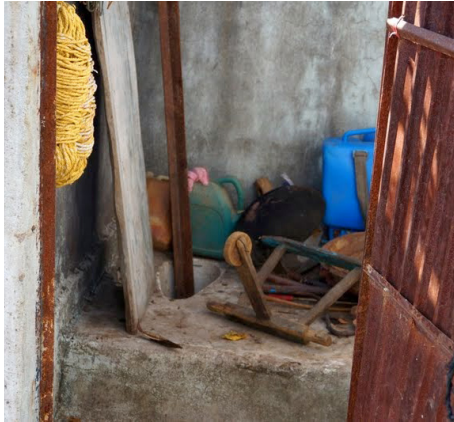
Defunct toilet in Madhya Pradesh.

Usage is much more difficult and expensive to measure than just counting toilets. Partial usage is even more difficult to monitor and requires household surveys that ask about sanitation habits of all members within a household or extensive observations. Statistics for partial usage are sensitive to survey methodology and the questions asked (for a critical analysis for India see Coffey and Spears 2014), further complicating matters. Methodology is rarely described in reports and wording of qualifying statistics is often vague. In consequence, the statistics on this that are available and presented below must be taken as indicative rather than precise.