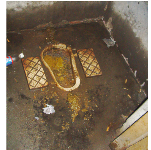
Filled up pit latrine Syedpur Village, Bangladesh.

The fear of pits becoming full can dissuade people from using toilets. Cost of emptying is one factor: the availability and perceived affordability of pit emptying services is a key issue in sustaining toilet usage and ODF conditions in Bangladesh (Hanchett et al 2011); in rural Laos, households unable to afford the average emptying