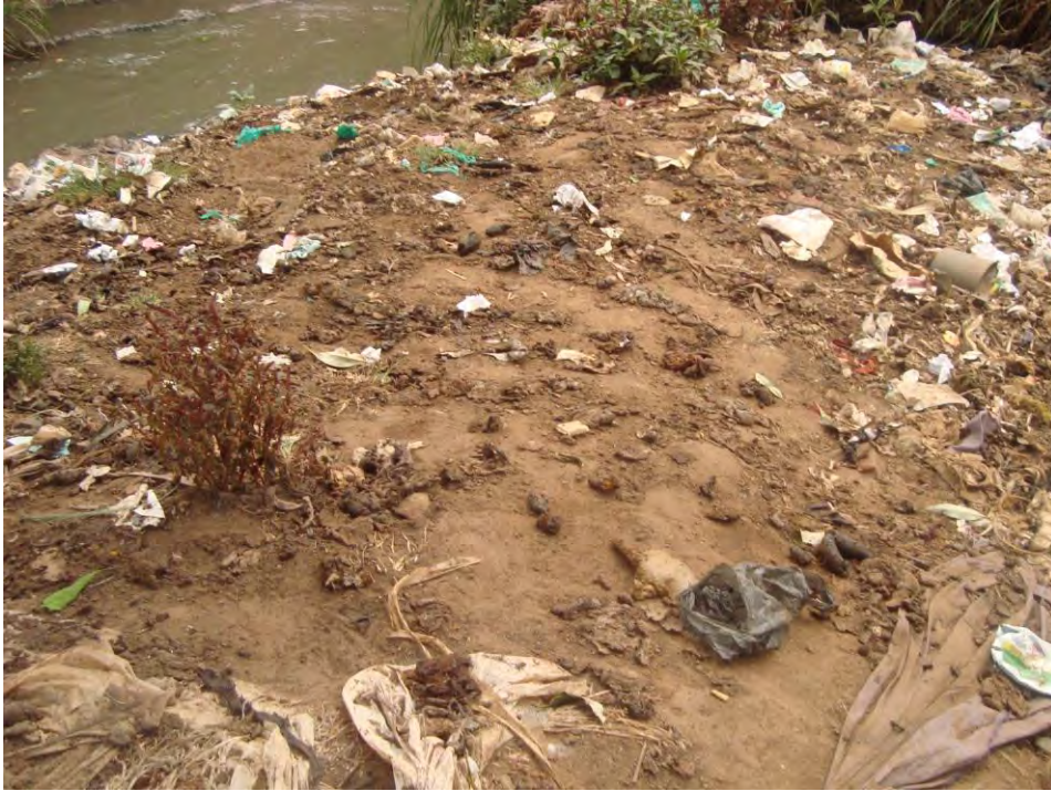
Image 3: A previous open defecation spot in Marathe, Nairobi, Kenya.