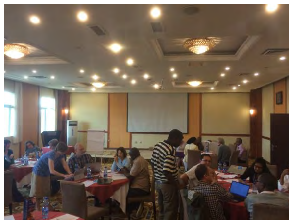
Images 1 and 2: Participants working together throughout the workshop.