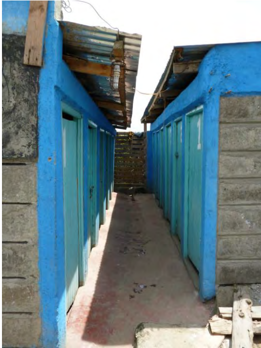
Image 10: A recently upgraded shared toilet and bathroom facility in Nakuru, Kenya.

urban areas is much smaller, however it is growing and beginning to demonstrate that a community-led model can work at scale in urban environments. In Nakuru, Kenya, 190,000 people have been reached, in Gularyia, Nepal, a town of 30,000 people became ODF in 6 months and in Rosso, Mauritania, close to 32,000 people are now living in an ODF environment. More examples are needed that document process and highlight results.