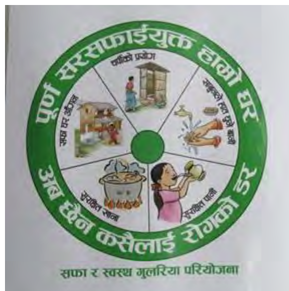
Image 7: Poster used in Gulariya, Nepal.

Workshop participants noted the greater potential for accessing more diverse media communications channels for post triggering follow-up in urban areas, for example radio, TV, newspapers, internet connection, newspapers. Post triggering follow-up can take advantage of these multiple messaging channels to reach a large number of people and a wide range of social groups. Billboards have been used at road intersections in Gulariya, Nepal, and facebook, blogs and WhatsApp have been used in Mathare, Kenya to reinforce messages about sanitation.