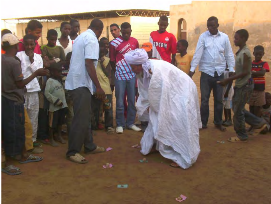
Image 6: Mapping exercise during a triggering session in Rosso, Mauritania.