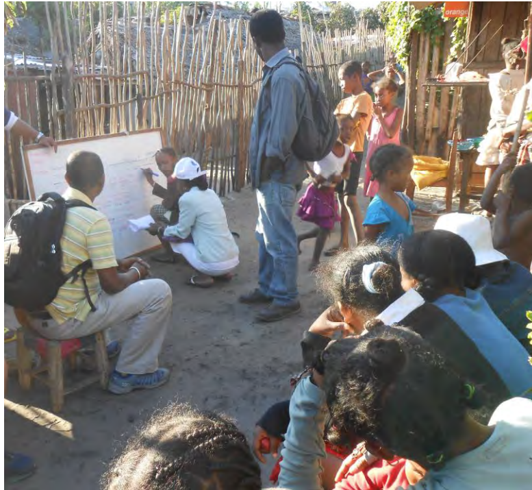
Image 9: Women write the results from a monitoring exercise in Fort Dauphin, Madagascar

New tools and methods may be needed for monitoring actions beyond ODF, e.g. solid waste management, waste water management, general cleanliness, etc. In Gulariya, Nepal, stickers have been designed for post ODF (termed Total Sanitation) monitoring. The round, blue sticker is divided into five segments each with a goal (e.g. waste water management, clean water, hand washing, latrine in use and maintained, solid waste management) and a check box. The sticker is placed by the front door of each house, visible to all, and as each element is achieved the segment is ticked. Finally, once all five goals have been achieved a green sticker is awarded. Once all households have achieved the green sticker the community celebrates Total Sanitation.