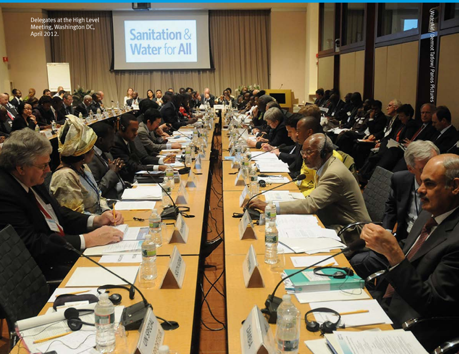
Delegates at the High Level Meeting, Washington DC, April 2012.

Front cover image: UN Secretary-General Ban Ki-moon addressing the participants of the Ministerial Dialogue on Sanitation and Water, Washington DC, USA, April 2012.