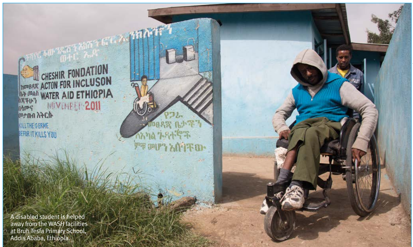
A disabled student is helped away from the WASH facilities at Bruh Tesfa Primary School, Addis Ababa, Ethiopia.

Efforts are underway in all case study countries to improve routine monitoring systems and build in regular review and learning mechanisms to support course correction.