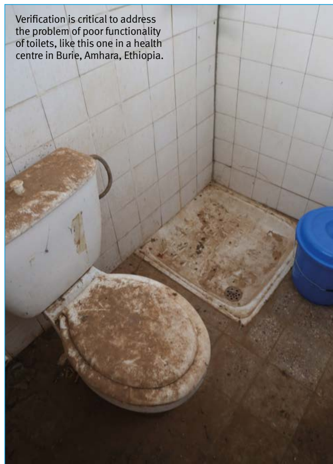
Verification is critical to address the problem of poor functionality of toilets, like this one in a health centre in Burie, Amhara, Ethiopia.