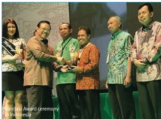
Sanitation and Water for All