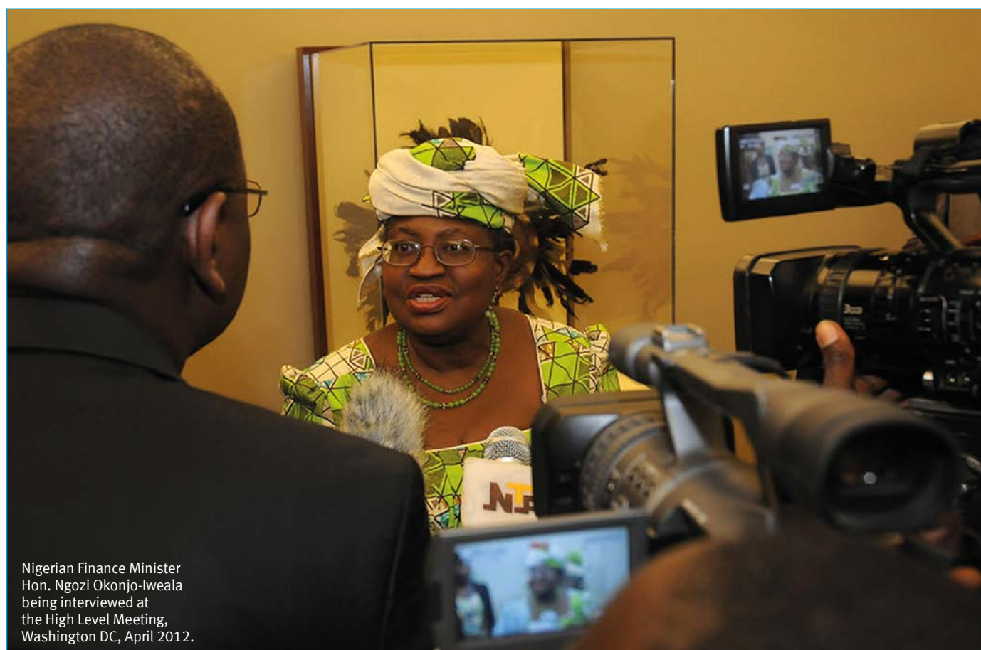
Nigerian Finance Minister Hon. Ngozi Okonjo-Iweala being interviewed at the High Level Meeting, Washington DC, April 2012.