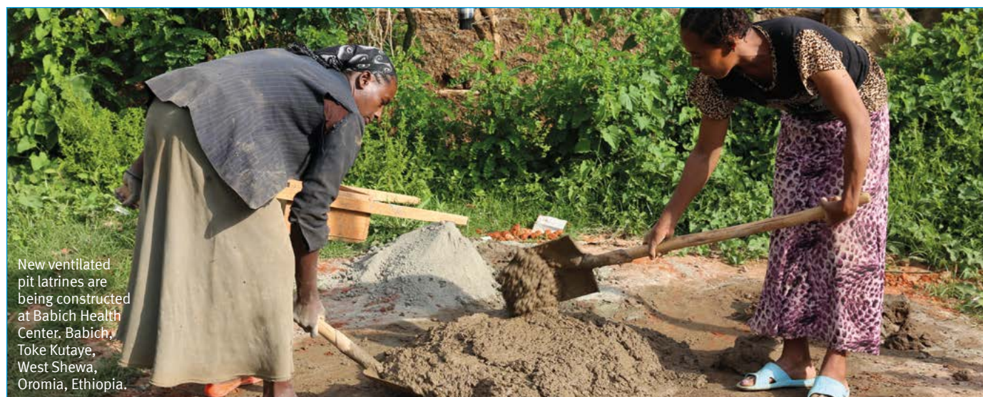
New ventilated pit latrines are being constructed at Babich Health Center, Babich, Toke Kutaye, West Shewa, Oromia, Ethiopia.

There are, however, examples of the current mode of prioritisation undermining course correction. One of the more apparent tensions is between the incentives created by top-down, target-driven or campaign-driven modes of prioritisation, and those needed for course correction. In India, pressures to deliver coupled with weak verification have historically impeded adaptation, evident in the over-reporting of toilets under SBM-G's predecessors. Ethiopia's Health Extension Programme provides strong implementation capacity down to the local level through Health Extension Workers. However, competing priorities determined by party-political campaigns, upward reporting and recurrent delivery pressures mean there is little opportunity to monitor and evaluate long-term outcomes, and therefore to course correct at more local level. Some interviewees in Ethiopia pointed out that top-down prioritisation may not be completely counterproductive to local learning, where guidance is clear, available, and allows flexibility to adapt to context. However, in Ethiopia's rural sanitation sector the impressive range of sanitation guidelines and manuals at national level is reportedly yet to be rolled out (and in some cases translated into the relevant language) for audiences in the woredas and kebeles of several regions.