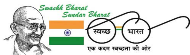
Logo of the Swachh Bharat Mission.

Despite backing from a senior political leader, Nirmal Bharat Abhiyan was insufficient to trigger a major upturn in sanitation progress. In 2014, newly elected Prime Minister Modi launched the Swachh Bharat Mission (SBM; Clean India Mission), aiming to achieve 100% access and usage of sanitation by October 2019. Much of the responsibility for designing implementation mechanisms has been delegated to state level, and Chhattisgarh has set an even more ambitious target of 100% sanitation access and use by December 2018.