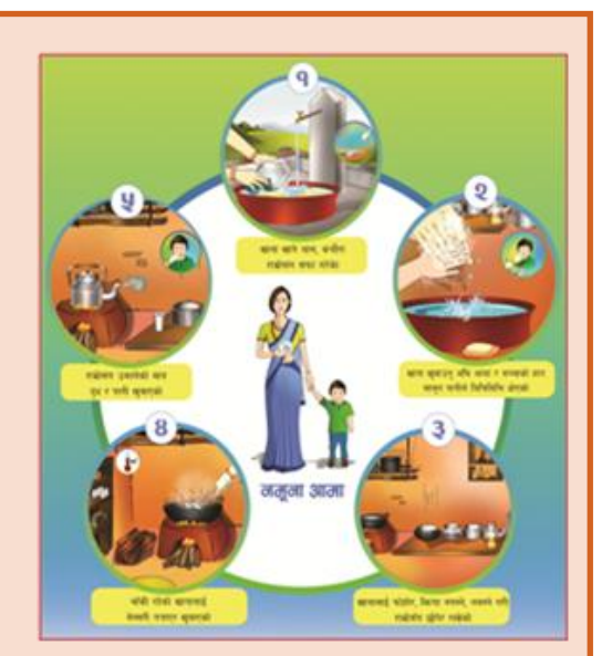
Five key food hygiene behaviours promoted in Nepal

Nepal: Building on the Mali and Bangladesh findings, SHARE funded the design, delivery and evaluation of an intervention to change the food hygiene behaviours of mothers in rural Nepal [28]. This consisted of a motivational package targeting five key food hygiene behaviours using emotional drivers rather than cognitive appeals as well as emphasis on change in behaviour settings. Four clusters received the intervention over a period of three months whilst four clusters remained a control group. Outcomes were measured in 239 households with a child aged 6-59 months. 43 percent of mothers were able to maintain all 5 key behaviours and the intervention was successful in significantly improving the microbiological indicators in child food. The results suggest that it is possible to substantially improve food hygiene behaviour and reduce the risk of microbiological contamination of child foods through scalable community level interventions.