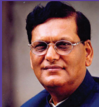
Dr. BINDESHWAR PATHAK Sulabh International

“Sulabh has always believed in having a dialogue with communities. Doing so has allowed us to cater to their needs, to address their anxieties, and to work towards meeting their aspirational demands. We have been pioneers in sanitation, and have worked at the grassroots to drive demand, to support construction, and to build-in sustainable treatment solutions. But much more needs to be done. With dedication, adequate sources for technical support, and partnerships from corporates can strengthen and facilitate the common agenda, we can do wonders in sanitation.”