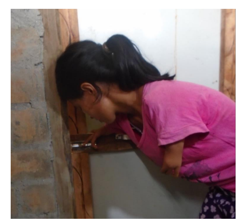
Caption: When I have to use the toilet, I need someone else to help with the latch otherwise I can't do it myself.