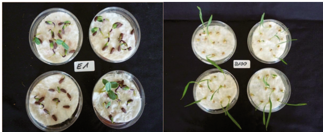
Figure 2: Germination test with sunflower (left) and wheat (right).

Urine inhibited germination of seeds when applied directly to the seeds; this effect was not visible in the field where the fertiliser was buffered by soil (see Figures 2 and 3).