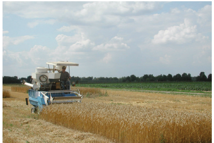
Figure 1: Harvest of wheat fertilised with urine.