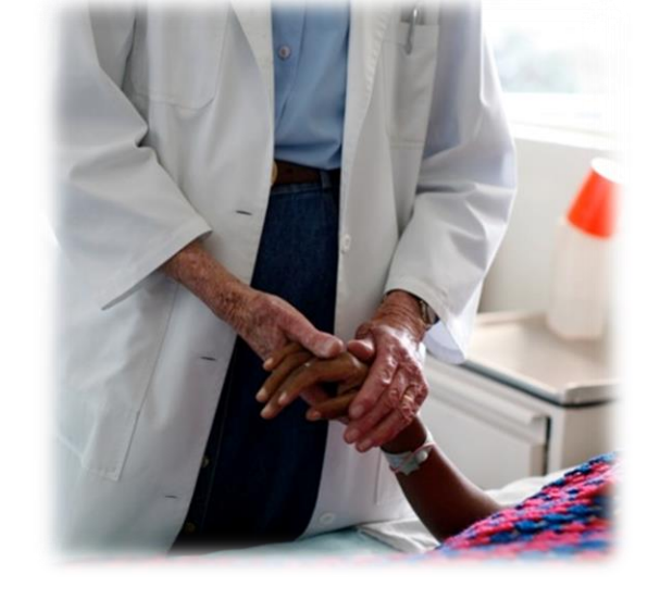
Saving And Improving The Preventing Disease in Lives of Women and Children