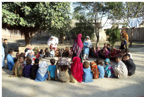
SLTS and triggering sessions at Peshawar.