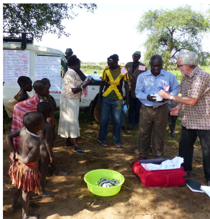
A CLTS triggering in Napatet in Kapoeta North County, South Sudan.

Following independence and the restoration of peace in 2006, the government and other agencies were ready to consider sanitation approaches that would better serve the long-term needs of the country. This led to the introduction of CLTS on a pilot basis. However, to begin with there was stiff resistance from many WASH agencies and actors in the country, who maintained that CLTS was inappropriate for a country