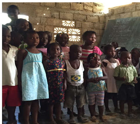
Children signing no more 'caca par terre' at a CLTS triggering in Haiti in 2015.