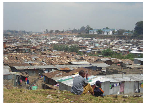
Mathare slum, Kenya, 2010.