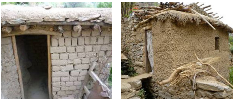
Kapisa, Afghanistan, post-CLTS implementation.

The CLTS process was incorporated to establish an understanding of the link between OD and diarrhoeal disease in order to stimulate demand for safe sanitation. Following successful CLTS triggering events, construction of latrines was left for homeowners and local tradesmen.