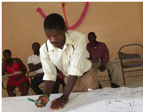
Natural leader in action in Haiti, 2015.