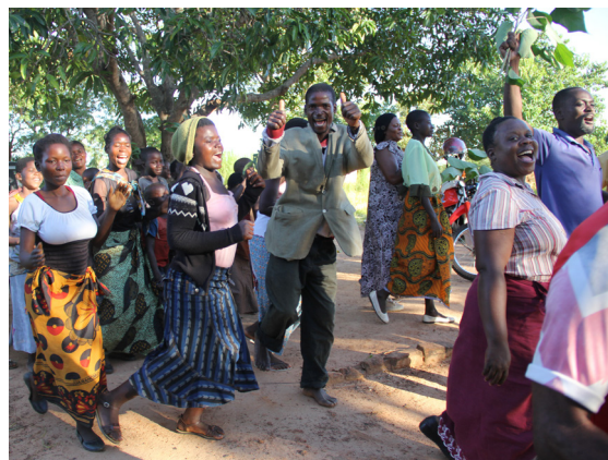
CLTS triggering in Malawi, May 2015.

There is also a clear need for sensitivity when triggering, the strong emotions it can bring up could be detrimental to the process ( Balfour et al ), and may not be appropriate or ethical in situations where people have experienced recent shock or trauma ( Polo ). As always, context is critical: facilitators must be experienced and understand the context and culture before implementation. A recent