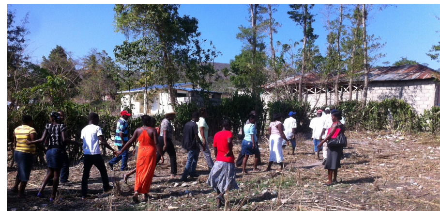
Transect walk, Haiti, 2015.

In rural sites where no latrines exist, family latrines are normally accepted as the most appropriate, sustainable option due to issues of ownership and day-to-day management. However, overall most progress was seen in sites which already had latrines, particularly in respect of families cleaning toilets.