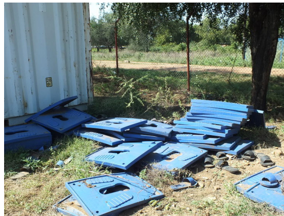
Unused slabs at a store in Kapoeta South, South Sudan because of no follow-up by the donor.

latrines. A broad group of natural leaders need to be involved in the CLTS programme to overcome this problem.