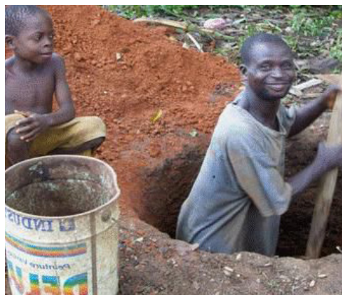
Community decision to stop OD in Haiti, leading to this man immediately beginning to dig a latrine.

A difficulty in urban sites has been the limited land available for building latrines, and sometimes landlords were unwilling for latrines to be built, since this suggested IDPs