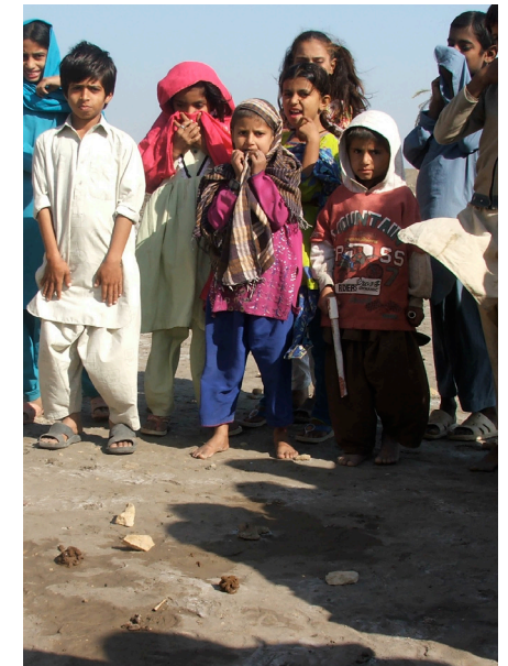
Triggering at Shahbaz camp, Hyderabad, Pakistan. In 2010, Pakistan was hit by its worst natural disaster when massive flooding affected an estimated 20 million people.

Four of the groups subsequently developed action plans for change, which incorporated: