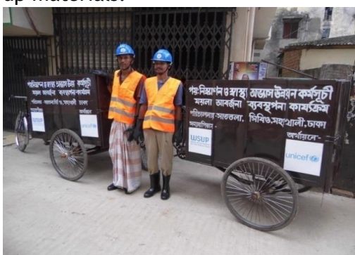
Picture 3: Solid Waste Management by Local Entrepreneurs in Dhaka LICs

Although this has yet to see significant scale, UNICEF has implemented pilot schemes for SWM in collaboration with NGOs. Efforts have been made at establishing a business model for SWM involving local private entrepreneurs and the residents of LICs. The process involved identification and selection of local entrepreneurs, as well as the provision of personal protective equipment, waste collection and transportation equipment, to the identified entrepreneurs to serve as set up materials.