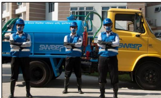
Picture 6: Faecal sludge emptying service, Dhaka

treatment and re-use elements of the FSM chain).