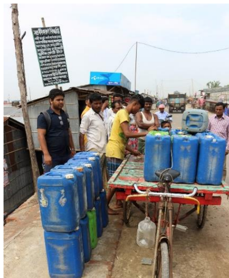
Picture 1: Water distribution and sale by Water Vendors in a Dhaka LIC.

when DWASA stopped the use of boreholes, due to concerns about ground water depletion and pollution of the aquifer, it provided opportunity for UNICEF to continue to work with DWASA to reach LICs.