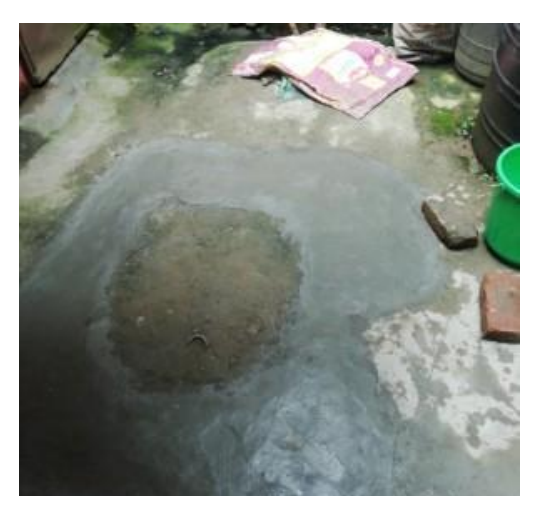
Figure 2: Containment system.

Majority of the population is dependent on combined sewer system (T1A1C1, 64%) while 3% of population has the user interface connected directly to open drain (T1A1C6, 3%). Containment systems used by people include septic tanks connected to a soak pit (T2A2C5, 1%), fully lined tanks (T1A3C10, 3%), lined tanks with impermeable walls and open bottom (T2A4C1, 1%; T1A4C6, 1%; T1A4C8, 3% and T2A4C10, 22%) and lined pits with impermeable walls and open bottom (T2A5C10, 2%). As per the Household Survey (2019), the average volume of the containment system in Kirtipur Municipality is 6 m³ (Figure 2).