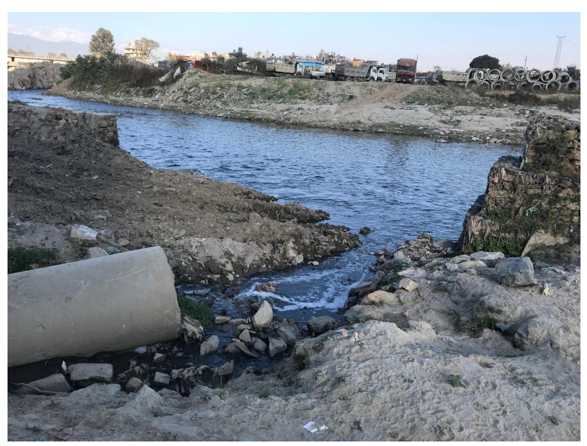
Figure 3: Wastewater and supernatant discharged into Bagmati River untreated.

Kirtipur Municipality lacks treatment plant, hence the wastewater, supernatant and faecal sludge are discharged directly into the Bagmati River untreated (KII1, 2019) (Figure 3).