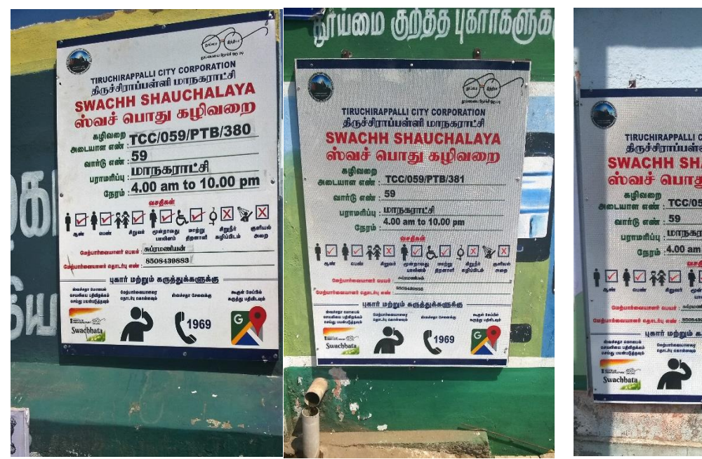
Figure 2.1: Woraiyur Market Complex Toilet Signboards with Unique Identification Numbers