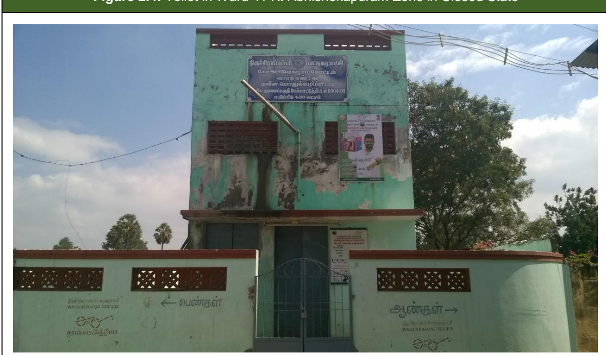
Figure 2.4: Toilet in Ward 41 K. Abhishekapuram Zone in Closed State