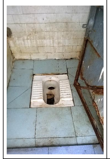
Figure 2.6 : Kuppankulam Ward No.19 Men's Toilet in Use Inspite of Rusted Doors