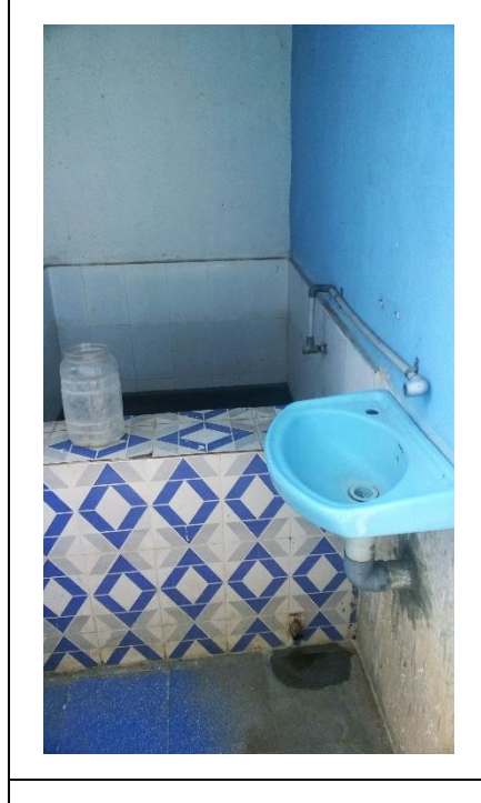
Figure 2.8: Washing Facility at Jalalgudhiri Street Toilet, Srirangam Zone