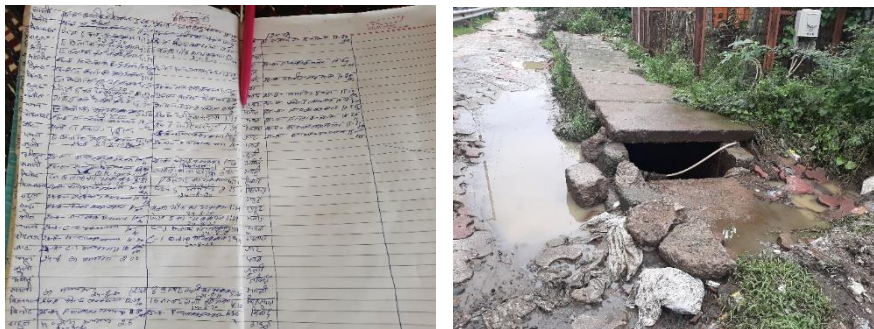
Figure 5: 1. Register maintained by private operator; 2. FS disposal at Ghitorni drainage line

The records are maintained in a common register by the private operator at the time of emptying service (KII-5, 2020; FGD-1, 2020). The GPS is installed by the owner of private vacuum tankers for tracking no. of trips and FS discharge at designated disposal points. However, the installed GPS is under process to be notified by DJB in order to restrict illegal disposal and better utilization of STP (KII-5, 2020). Emptying service is carried out by 2 workers and charges are varying from INR 600 to INR 2500 based on the containment size and service area (HH Surveys; KII-5, 2020; FGD-1, 2020). DJB has fixed the emptying charges at INR 1200/- but private operators charges on a higher side due to difficulty in accessing the narrow lanes (HH Surveys; KII-5, 2020; FGD-1, 2020). All the vehicles are licensed under DJB (KII-5, 2020).