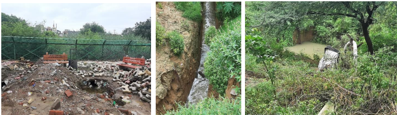
Figure 1: Wastewater Flow in Aya Nagar: 1. Village Johar, 2. Wastewater flow into Ravines 3. Use of motor pump to reuse wastewater for horticulture purpose

There is no sewerage network in Aya Nagar (Field Observation; KII-1, 2020). The village is completely dependent on on-site sanitation systems which may or may not be connected to open drains. The open drains in the city ends up in low lying area which are basically ravines (Field Observation; KII-2, 2020). Majority of households in Aya Nagar have piped water supply. The source of water include DJB borewells and partly by Sonia Vihar Water Treatment Plant. There are some households which are dependent upon water tankers (Field Observation; KII-3, 2020; KII-4, 2020). There are 2 Johars 5 in Aya Nagar named as village johar and colony johar which receive the wastewater from village & colony area respectively and then entire wastewater flows into ravines. The wastewater from ravines is pumped back for horticulture purposes