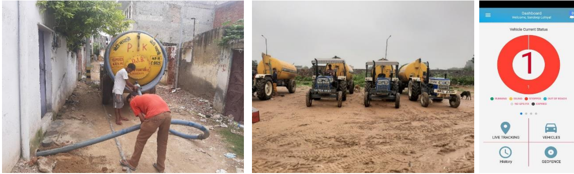
Figure 4: 1. Emptying process in HH; 2. Assembly point for vehicles; 3. Installed GPS tracking app

The records are maintained in a common register by the private operator at the time of emptying service (KII-5, 2020; FGD-1, 2020). The GPS is installed by the owner of private vacuum tankers for tracking no. of trips and FS discharge at designated disposal points. However, the installed GPS is under process to be notified by DJB in order to restrict illegal disposal and better utilization of STP (KII-5, 2020). Emptying service is carried out by 2 workers and charges are varying from INR 600 to INR 2500 based on the containment size and service area (HH Surveys; KII-5, 2020; FGD-1, 2020). DJB has fixed the emptying charges at INR 1200/- but private operators charges on a higher side due to difficulty in accessing the narrow lanes (HH Surveys; KII-5, 2020; FGD-1, 2020). All the vehicles are licensed under DJB (KII-5, 2020).