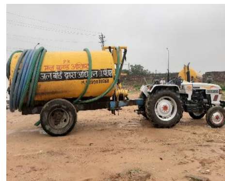
Figure 6: Private Vacuum Truck

Transportation: The emptied septage is transported through the truck mounted vacuum trucks in around 2-3 trips per day (KII-5, 2020; FGD-1, 2020). Average 1100 trips/month are made for emptying of FS in Aya Nagar (KII-5, 2020; FGD-1, 2020). The emptied faecal sludge (FS) by vacuum trucks is discharged into nearby farmlands, drainage line (Ghitorni) and trunk sewers in the vicinity (Field Observation, FGD-1, 2020).