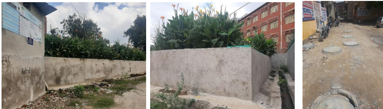
Figure 8: Decentralized Wastewater Treatment Plant (Reed-Bed) in Z Block Aya Nagar

Aya Nagar has recently implemented pilot Decentralised Wastewater Treatment project 6 based on constructed wetland (reed bed) of 100 KLD capacity for wastewater treatment of Z Block area. The block has around 80 households. These households have onsite sanitation systems. The outlet of these onsite sanitation system (i.e. supernatant) and grey water is connected to biodigesters. These biodigesters are further connected to Decentralized Wastewater Treatment system via small bore sewers. The final treated wastewater from the outlet gets mixed with drains flowing into Johar (Field Observation; KII-8, 2020). However, the plans are to utilize the treated wastewater in public parks, school gardens, maintaining water flow in Johar (KII-8, 2020). Both SN & FS is delivered to treatment plant is getting treated. Therefore, variable F5, S4d & S5d is considered 100% in SFD Matrix.