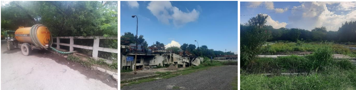
Figure 7: 1. Disposal of FS in STP inlet; 2. STP Qutub Minar; 3. Sludge drying bed at STP

Treatment/Disposal: There is STP of 5 MGD capacity in Qutub Minar which is designated for disposal of FS from Aya Nagar, Vasant Kunj and Chattarpur area (Field Observation; KII-1, 2020; KII-5, 2020; KII-7, 2020). However, at present only 3 vacuum trucks out of the total 24 vacuum trucks from Aya Nagar dispose off at STP due to longer distances (KII-7, 2020). The STP is functioning well to its full capacity while complying with CPCB discharge standards (KII-7, 2020). The treated wastewater (around 4 MGD) is used for horticulture purpose and excess is released into nearby nallahs (KII-7, 2020). The sludge generated at STP is stored in sludge drying beds and given to the farmers or used for horticulture purpose (KII-7, 2020).