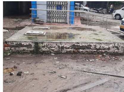
Figure 3: FLT no outlet or overflow in bus stand PT

Emptying: The locality is dependent on privately operated mechanised desludging service for emptying faecal sludge from FLTs (Field Observation; FGD-1, 2020; KII-5, 2020). The emptying frequency varies from once in a month to once in a year (demand based) depending upon the nature and the size of containment system (HH surveys; FGD-1, 2020). During field visits, it has been observed that most of the households in the locality have large family size (including tenants / paying guests) which creates the need for frequent emptying services. There are total 32 private vacuum trucks plying in the village, out of which 24 are functional (KII-5, 2020; FGD-1, 2020). Each of these vacuum trucks are GPS enabled, equipped with motorised pumps and have a storage capacity of 5000-6000 L (KII-5, 2020; FGD-1, 2020). In order to carry out the work in narrow and congested areas, these vehicles are equipped with ~100 ft long hose.