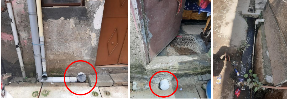
Figure 2: FLT no outlet/overflow (an outlet located outside at every household for an easy accessibility to private emptiers) and FLT connected to open drains (Ekta/CSE, 2020)

The general size of FLTs varies from 8 – 10 ft * 5 – 10 ft * 6 – 12 ft, depending upon the household size, income level, community, etc (Field Observation; KII-1, 2020; KII-5, 2020; FGD-1 & 2, 2020). The FLTs which are mostly single chambered with impermeable walls & sealed vaults.