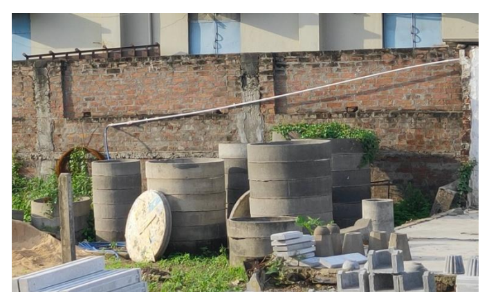
Figure 1: Cement Rings used for lined pits

Containment: Based on sample household surveys, KIIs and FGDs with relevant stakeholders, it was concluded that 100% population is dependent on the On-site Sanitation Systems (OSS). The prevalent OSS in the city are septic tanks connected to open drain (T1A2C6, 57%), fully lined tank (sealed) connected to open drain (T1A3C6, 23%) and lined pit with semipermeable walls with open bottom no outlet or over flow where there is significant risk of ground water pollution (T2A5C10, 20%).