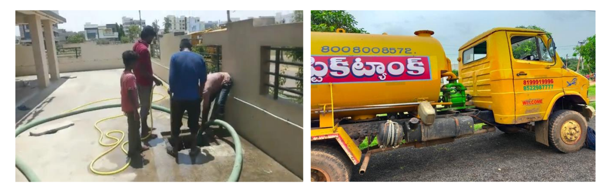
Figure 3: Emptying process in household through private truck mounted vacuum tanker The private emptiers are not provided with Personal Protective Equipments (PPEs) (FGD-2, 2020). There are no instances of manual scavenging found in the city (Field observation,KII-2,2020)

Transportation: The emptied faecal sludge is transported through truck mounted vacuum tankers in around 2 trips per day (FGD2, 2020). The emptied faecal sludge is discharged into the drainage canal where open drains and storm water drains end (Field observation; KII-3, 2020). The drainage canal travels 33 km in mid way, recieving wastewater from surrounding towns and villages and without any pre-treatment, ends up near Coringa wildlife sanctuary and Mangroove forest near the