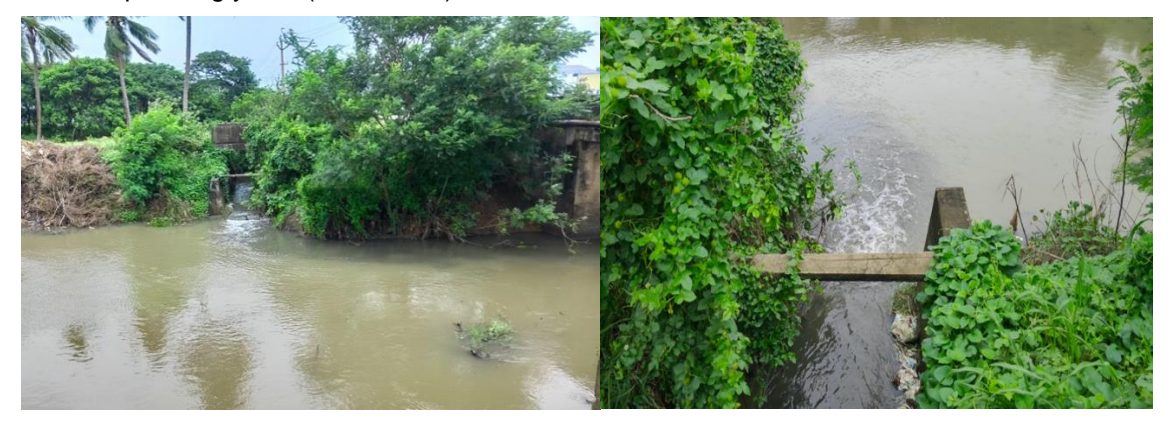
Figure 5: Storm water drains ending up in the drainage canal near Mandapeta- Alamuru road

Treatment/Disposal: There is no Faecal sludge treatment plant (FSTP) and Sewage treatment plant (STP) in the town. Therefore in the absence of such provision, the private emptier discharge the faecal sludge in open drains, nullahs etc. Since there is no proper treatment of emptied faecal sludge, F5 & S5e is considered 0% in SFD matrix. Municipality has given a proposal for FSTP in Veerabhadrapuram area in upcoming years (KII-1, 2020).