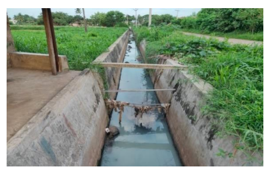
Figure 4 : Wastewater & supernatant flowing in storm water drain

Transportation: The emptied faecal sludge is transported through truck mounted vacuum tankers in around 2 trips per day (FGD2, 2020). The emptied faecal sludge is discharged into the drainage canal where open drains and storm water drains end (Field observation; KII-3, 2020). The drainage canal travels 33 km in mid way, recieving wastewater from surrounding towns and villages and without any pre-treatment, ends up near Coringa wildlife sanctuary and Mangroove forest near the