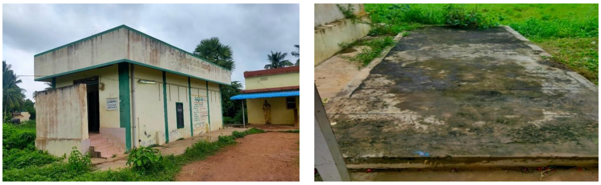
Figure 2: Community toilet (left) and Septic tank in community toilet (Right)

Community Toilets/Public Toilets : There are 1 public toilet and 10 community toilets across the town which are constructed under Swaach Bharath mission (SBM,2016). About 353 households which do not have individual toilet facility due to low income settlement and insufficient space are mostly dependent on community toilets (Field observation; KII-6, 2020). Separate toilet facilities are provided for men and women in all community toilets (Field observation; KII-1, 2020). These community toilets are well maintained by co-operative society (Field observation; KII-6, 2020). Community toilets and public toilets are connected to septic tanks whose outlet is connected to open drain (Field observation; KII-5, 2020). The average size of septic tanks in community toilet and public toilets is 4 x 3 x 3 m.