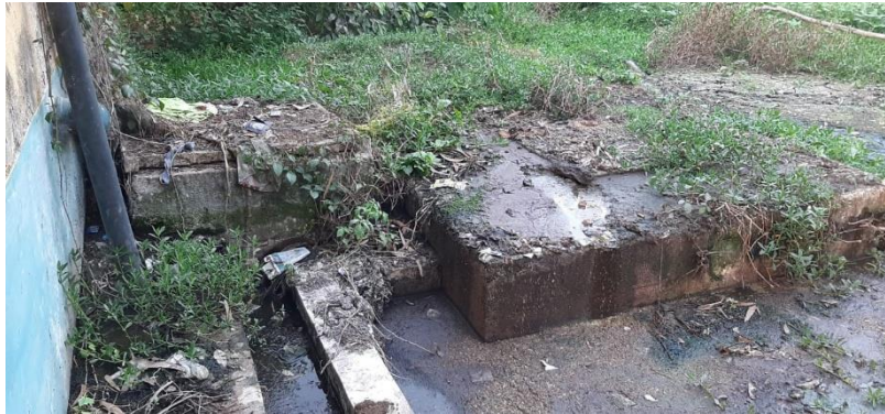
Figure 2: Septic tank connected to open drain, Source: Manish/CSE, 2020

(T1A2C6), 22% population is dependent on septic tank connected to soak pit (T1A2C5), 9% population is dependent on lined tank with impermeable wall and open bottom (T1A4C10), 34% population is dependent on lined pit with semi permeable wall and open bottom (T2A5C10) and 4% population is dependent on unlined pit with no outlet where there is significant risk of ground water (T2A6C10). (FGD-1, 2020)