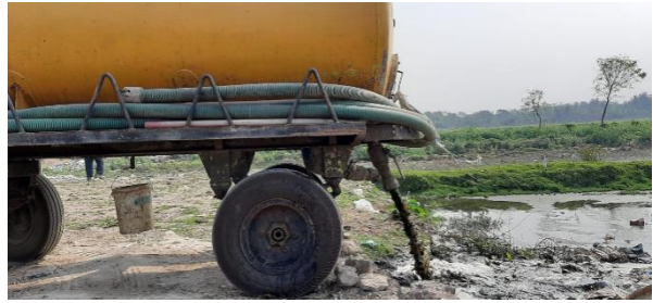
Figure 6: Discharge of Faecal Sludge into open ground

Treatment/Disposal: Haldia municipality owns two tractor mounted vacuum tankers and FS is disposed of at the designated site, Raira Chowk, Ward No. 18. Depending upon the irrigation requirement of the crops, farmers often use discharged FS. Since there is no proper treatment of emptied FS, F5 is also considered to be Zero. (KII-4, 2020)