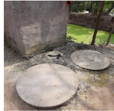
Figure 3: Twin - Pit system, Source: Manish/CSE, 2020

Due to insufficient data, it was difficult to assess the volume of effluent and solid FS generated by each of these containment systems, thus it is assumed 50% in SFD matrix to reduce maximum error. In this case, the 24% population dependent on systems T1A2C6 constitutes to 12% 'SN not contained' and 12% population constitutes to 'FS not contained'. The system T2A5C10 and T2A6C10 shows that 38% FS Contained therefore total of 50% is 'FS Not Contained'. The system T1A2C5 and T1A4C10 shows that 31% population constitutes to 'FS Contained'.