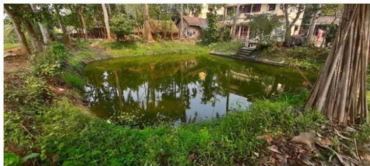
Figure 1: Natural Pond in front of house, Source: Akansha/CSE,

According to the Census, 6% of the city is dependent on sewer system but as per KII, FGD and field survey the city's sewer lines were observed to be defunctional. Hence, offsite is considered to be zero.