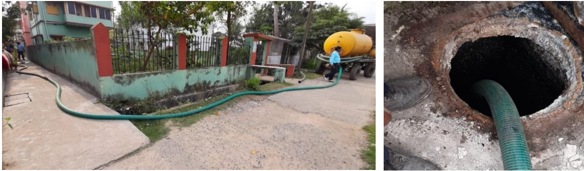
Figure: 4 Emptying Process through vacuum tanker, source: Manish/CSE, 2020

The field survey revealed that population dependent on T1A2C6, T1A2C5, T1A4C10, T2A5C10 and T2A6C10 systems, get their containments emptied. As shown in the SFD matrix, 50% 'FS not Contained', is further bifurcated into 9% from septic tank connected to open drains (T1A2C6), 17% from lined pit with semi permeable wall and open bottom no outlet or overflow where there is a significant risk of groundwater (T2A5C10), 2% from unlined pit no outlet or overflow where there is a significant risk of groundwater (T2A6C10), 16.5% from septic tank connected to soak pit (T1A2C5) and 6.75% from lined tank with impermeable wall and open bottom no outlet or overflow (T1A4C10). Also, in case of 31% 'FS Contained', the percentage is bifurcated into 22% from septic tank connected to soak pit (T1A2C5) and 9% from lined tank with impermeable wall and open bottom no outlet or overflow (T1A4C10).