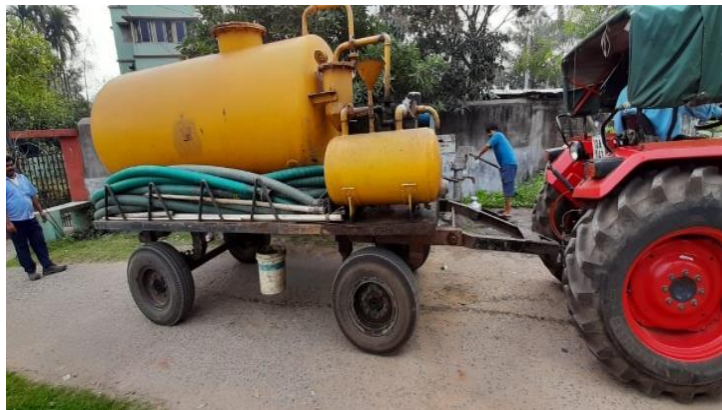
Figure 5: Transportation of FS by Vacuum Tanker, source: Akansha/CSE, 2020

Transportation: Emptiers discharge FS in the open drains or in any nearest low-lying open grounds, in and around the city. Due to narrow, congested roads and high cost of mechanical desludging, manual emptying is also prevalent in low income groups. Based on Key Informant Interviews (KII) in generally LIG dwellers empty their containment system on their own manually. Spade and bucket are used by them for this process without using any safety gears. The manual emptying is usually carried out by 2 - 4 people, depending upon the size of the containment and the degree of density of FS in the containment. Since none of the FS getting emptied is delivered to the treatment facility F4 is considered to be zero.