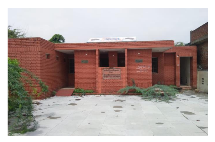
Figure 4: Ocassionally used Public toilet constucted under Namami Gange

According to the Executive Officer and Computer Operator, 967 Individual Household Latrines (IHHL) have been provided to households having no toilets or access to community toilets in the vicinity or to households with insanitary toilets as of August 2020, under Swachh Bharat Mission (SBM). FLTs in Bithoor are either square or rectangular in shape whereas septic tanks are mostly 2 chambered tanks. Most of the containment systems constructed even under SBM are Lined pits with semi permeable walls and open bottom, no outlet and no overflow. This is due to the local belief that lined pits with honeycomb structure is better than conventional septic tank as lined pits do not result in supernatant flowing out of system.