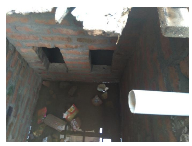
Figure 3: Fully lined tank connected to open drain